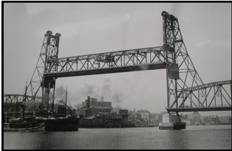
Memorial Bridge 1924

Prepared for the New Hampshire Department of Transportation by