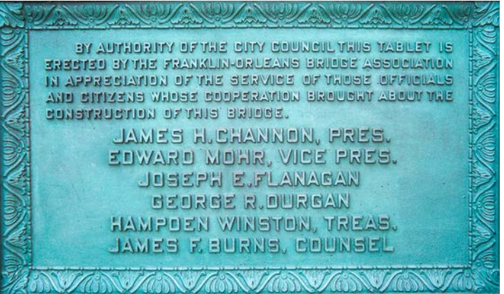
Franklin-Orleans Bridge Association plaque

neighborhood formed the Franklin-Orleans Bridge Association. This group used their political influence to lobby for the construction of this new bridge sooner rather than later. On October 27, 1915, the Tribune reported that Chicago Aldermen and Illinois congressmen agreed to support this bridge project. The aldermen added this bridge to the 1916 budget and the congressmen pressured federal agencies for the necessary permits. This paved the way for the final design and the start of construction.