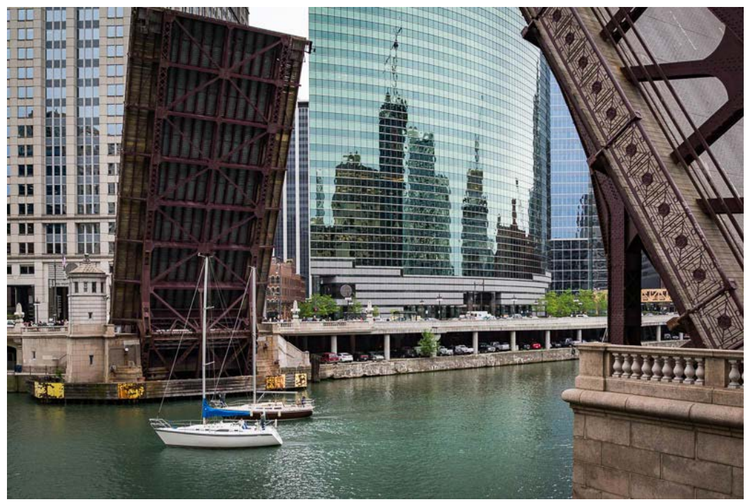
Franklin St bridge raised for a spring boat run

Over the 95 year life of the Franklin St bridge, the Chicago Public Works Department and its successor CDOT have been its faithful stewards (as well as other movable bridges on the Chicago and Calumet rivers). We owe a debt of gratitude to all of the individuals involved in the design, construction, maintenance, and operation of this beauty. Through their efforts we are able to appreciate Chicago's early 20<sup>th</sup> Century design ingenuity and thrill when its leaves rise skyward.