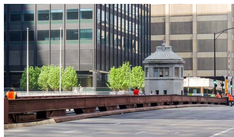
"Hand-rail height" truss first implemented at Madison St - 1922

In view however of the appreciation of the deck structure at Jackson Street now completed and the demand for structures of a hand-rail height truss at other points, I have determined to ascertain if a bridge of this latter type could be built at Franklin-Orleans Street without too great a sacrifice to the river interests or unreasonable outlay of money. This matter has been up before and at our request Mr. Pihlfeldt made comparative studies of various