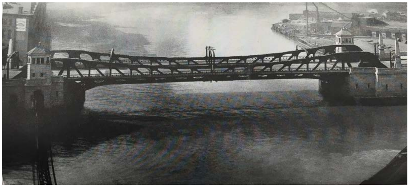
Franklin-Orleans St. Bridge, Jan 26, 1921 (from the 1920 CPW Annual Report, Kettler-Elliot Co, Contractors for the Superstructure)

The early photograph shown of the completed bridge was provided in the 1920 Annual Report of the Chicago Public Works Department. The bridge plaque summarizes the organizations and individuals with major responsibilities in the project.