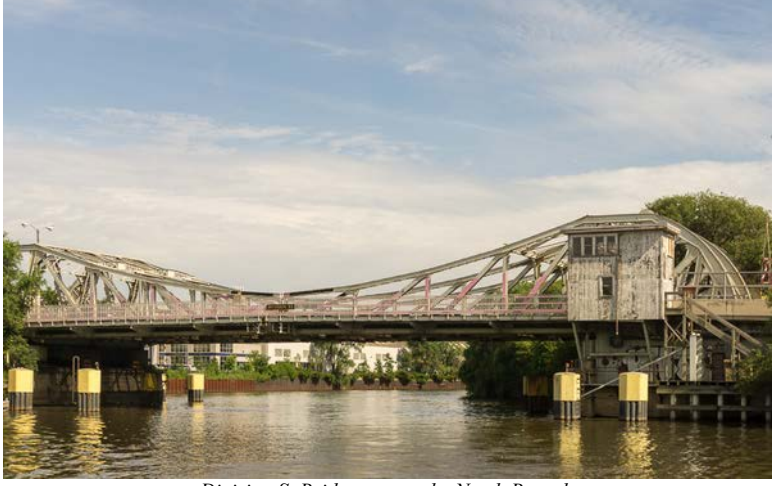
Division St Bridge across the North Branch

Chicago was under pressure by the federal government and shipping interests to replace all of the swing bridges on the Chicago River.