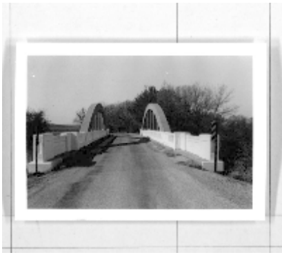
Solider Creek Marsh Arch Bridge. 10/1980.