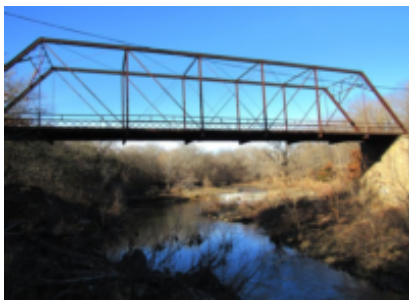
Elk Falls Pratt Truss Bridge. 12/25/2014.