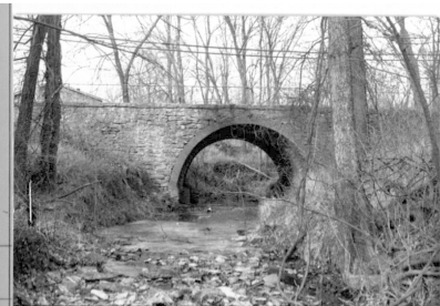
Baldwin-Media Bridge. Winter 1988.