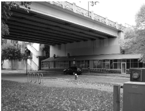
Figure 6. Looking northwest at the north abutment. A recently installed stairway of modern design to access the west sidewalk on the bridge is visible just to left of the building attached to the abutment.