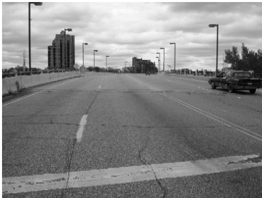
Figure 1. Looking north at the bridge from the south approach. The vehicle barriers are not symmetrical on the south end. A low profile barrier is provided on the east and a taller barrier is provided on the west. The approach roadway pavement is deteriorated and has extensive cracking.