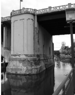
Figure 5. Looking east at the southernmost river pier. Deteriorated concrete is visible in many locations, primarily near the water line. The weathering steel beams supporting the south approach spans are also visible.