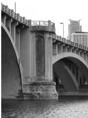
Figure 7. Staining and concrete spalls are visible on the north face of the west end of the pier between the barrel and rib arches.