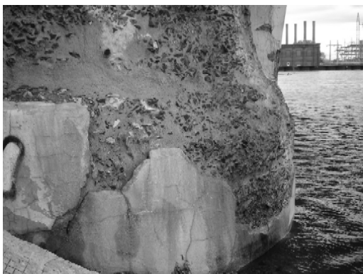
Figure 8. Looking east at the northernmost river pier. Shotcrete repairs to the pier have failed. Large spalled regions, with water draining out of the deteriorated area, were visible during the site visit.