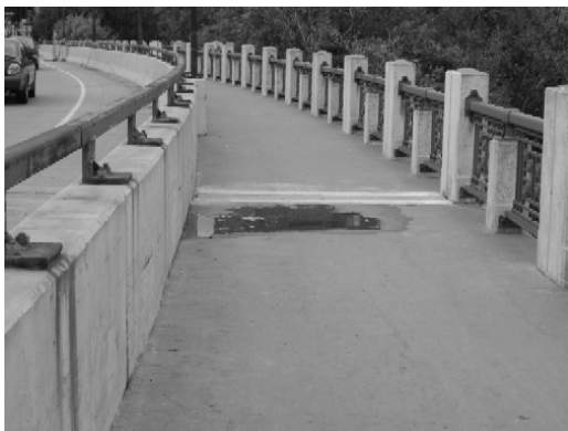
Figure 3. Looking north at the north end of the east sidewalk. Localized ponding adjacent to a reconstructed sidewalk expansion joint is visible. Staining on the vehicle barrier from the metal railing components and anchorages is typical.