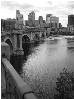
Figure 2. Looking south along the west side of the bridge from the west sidewalk. Stained, deteriorated concrete on the pier below the overlook is visible.