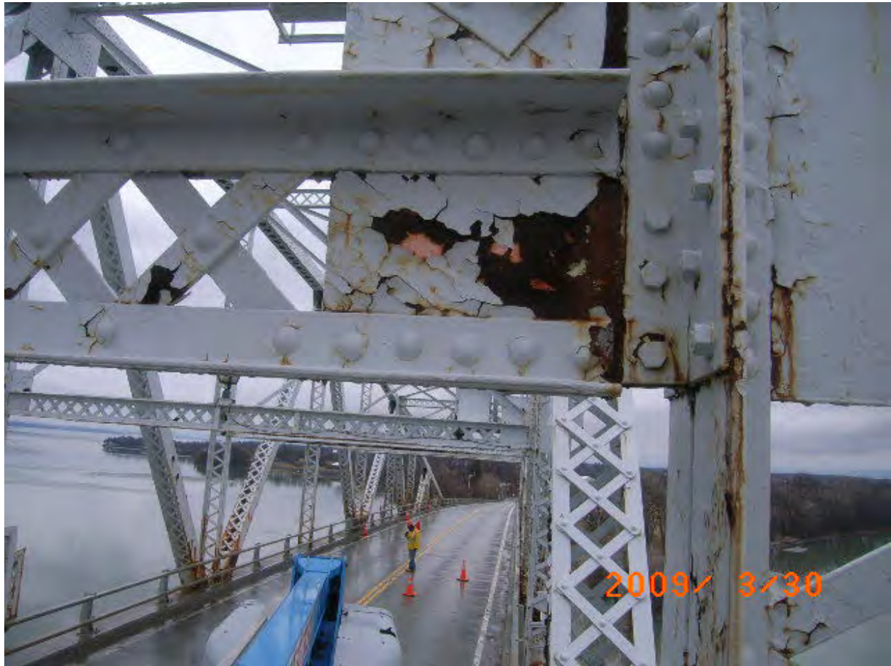
Figure 110. Span 7 strut at Panel Point 16.