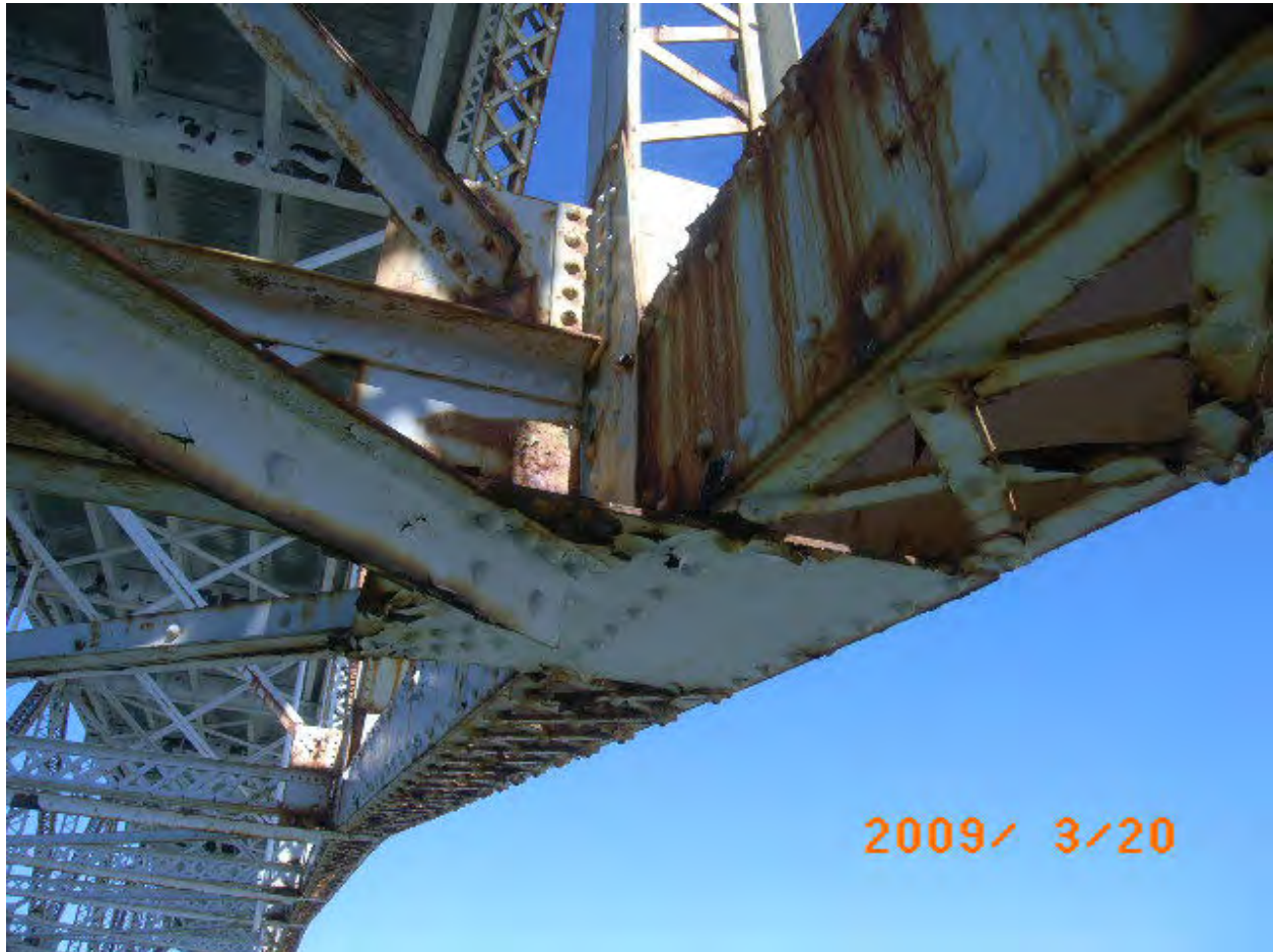
Figure 120. Span 6 lower chord connection at L01 (Spans 4, 5, 6, 8 and 9 are similar).