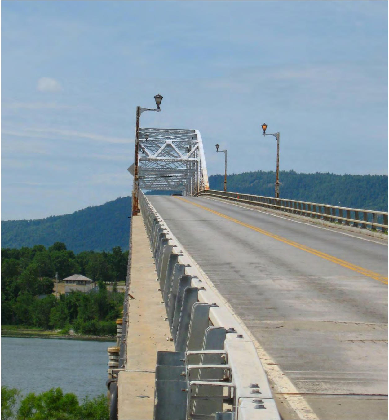
Figure 82. View of the north portal from Span 8. July 2009.