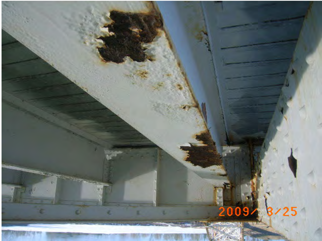
Figure 118. Span 7 Panel 20 stringer.