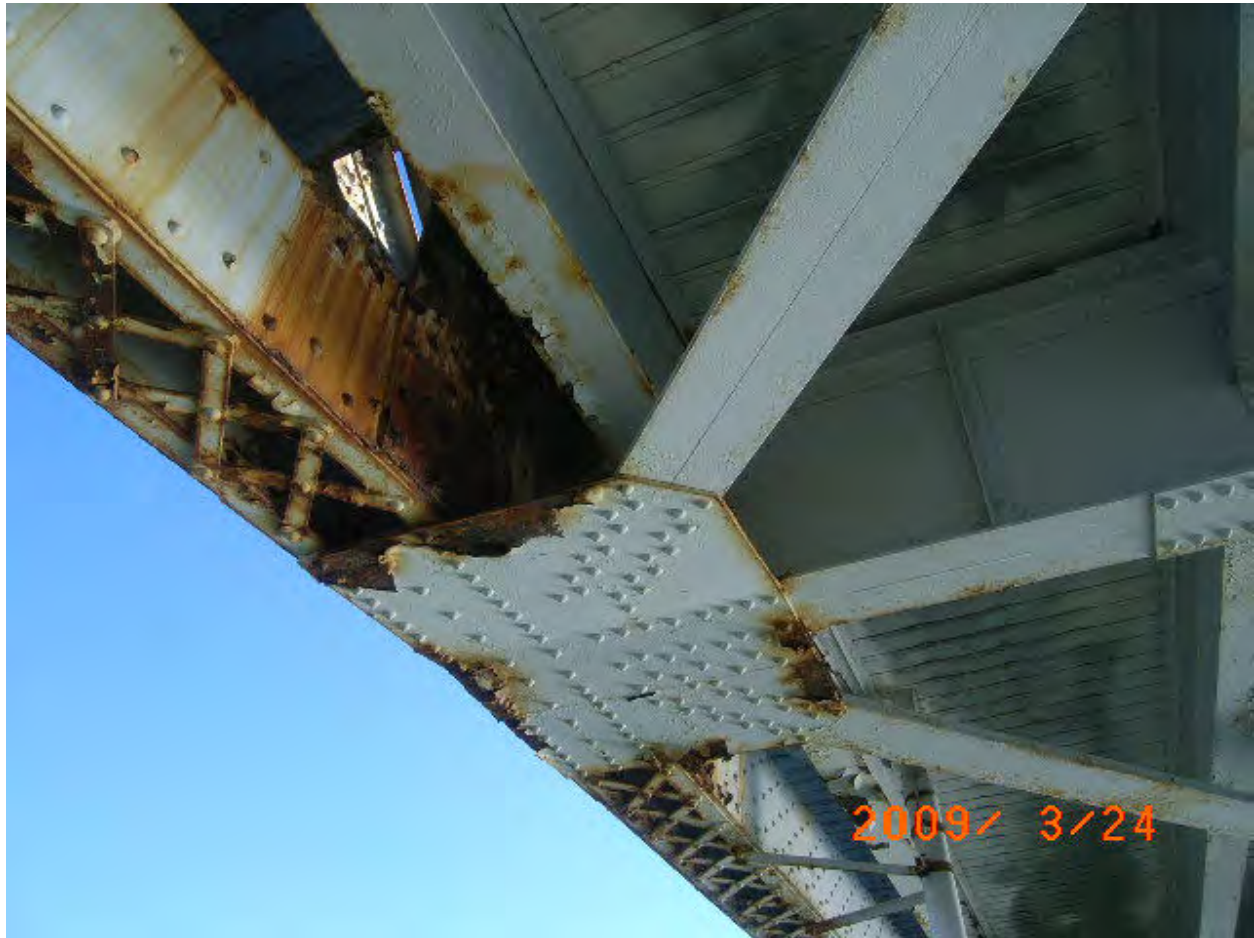
Figure 116. Span 7 lower chord lateral connection at L14.