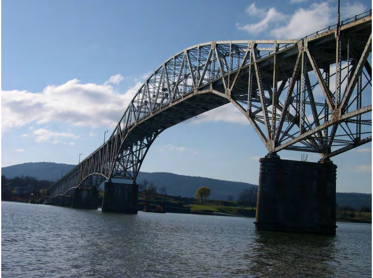
Figure 96. View of Span 7, east side, from Vermont. Photograph by recording team, New York State Museum, November 2009.