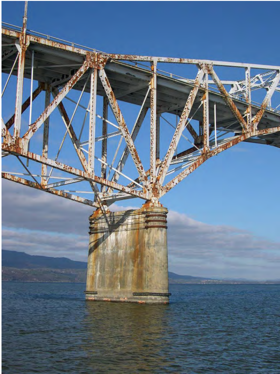
Figure 94. View of Spans 6 and 7 at Pier 6, east side. Photograph by recording team, New York State Museum, November 2009.