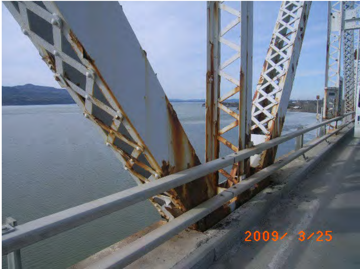
Figure 112. Span 7 deck at connection L16.