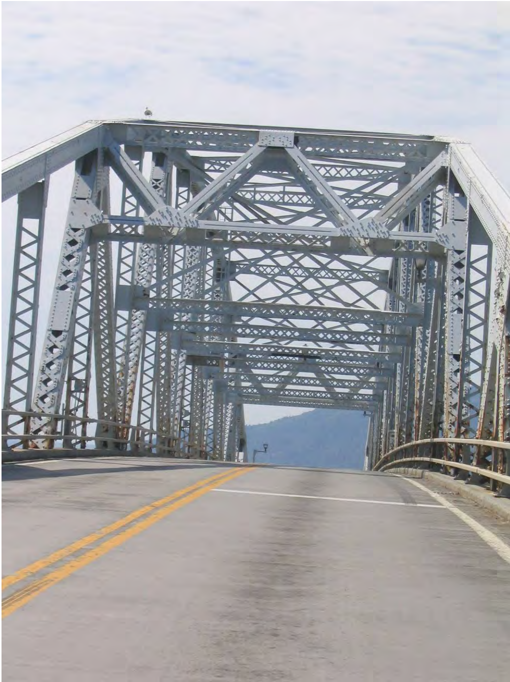
Figure 83. View of the north (Vermont) portal. Photograph by New York State Department of Transportation, July 2009.