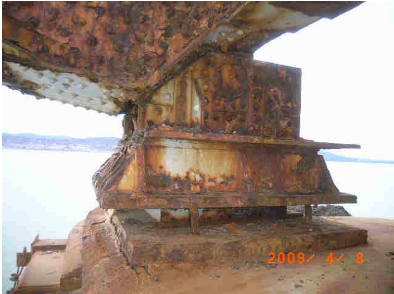
Figure 129. Span 8 at Pier 8, left truss roller bearing.