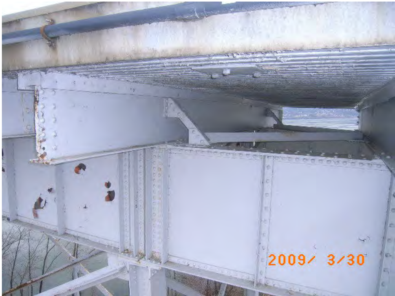
Figure 124. Span 11 Floor Beam at G2 (All girder spans are similar).