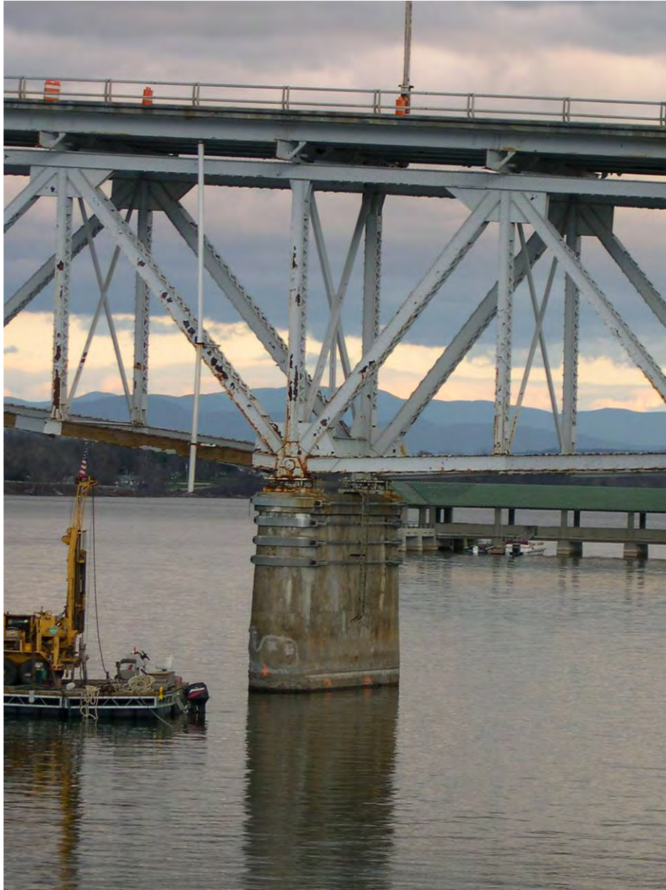
Figure 89. View of Spans 4 and 5 at Pier 4, west side. Photograph by recording team, New York State Museum, November 2009.