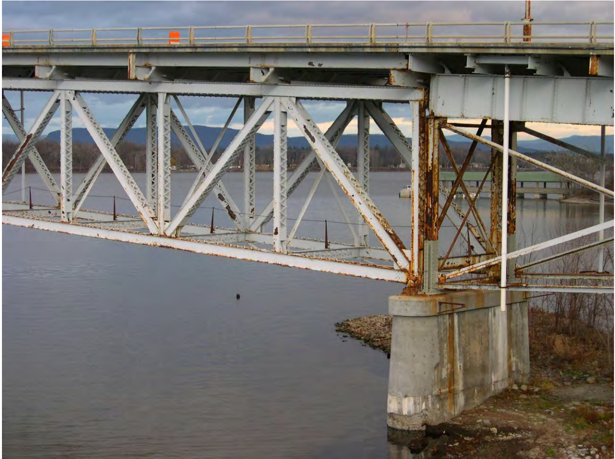
Figure 87. View of Spans 3 and 4 at Pier 3, west side. Photograph by recording team, New York State Museum, November 2009.