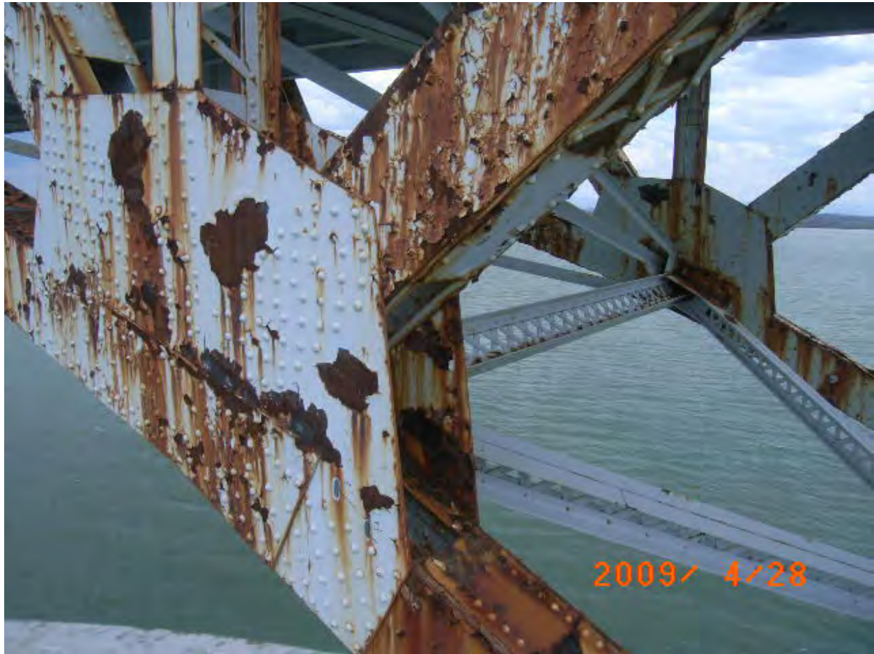
Figure 114. Span 7, lower chord connection at L12.