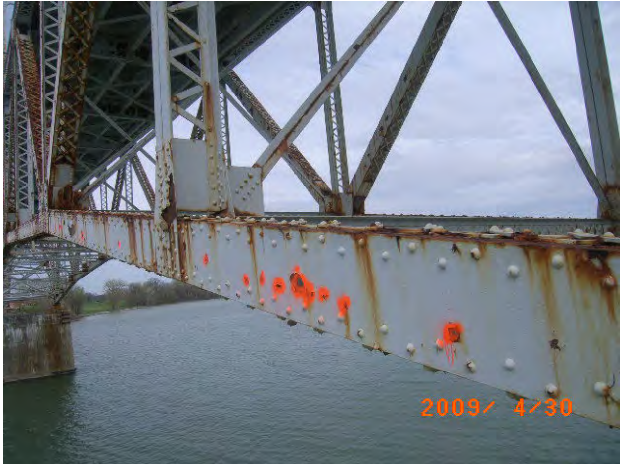
Figure 121. Span 6 lower chord at L00-L02.