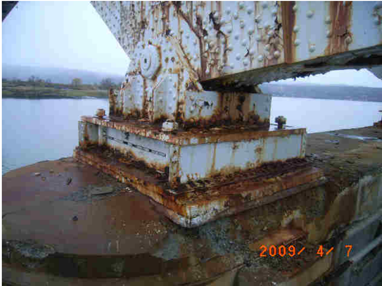
Figure 128. Spans 7/8 at Pier 7, right truss rocker bearing.