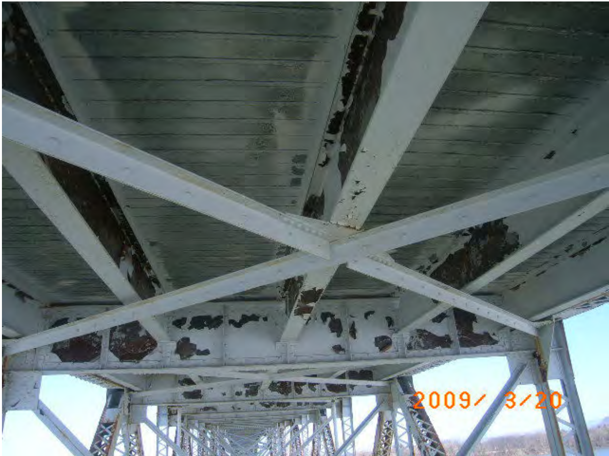
Figure 123. Span 6, Panel 2, laterals, stringers, and floor beam (Spans 4, 5, 6, 8, 9 are similar).