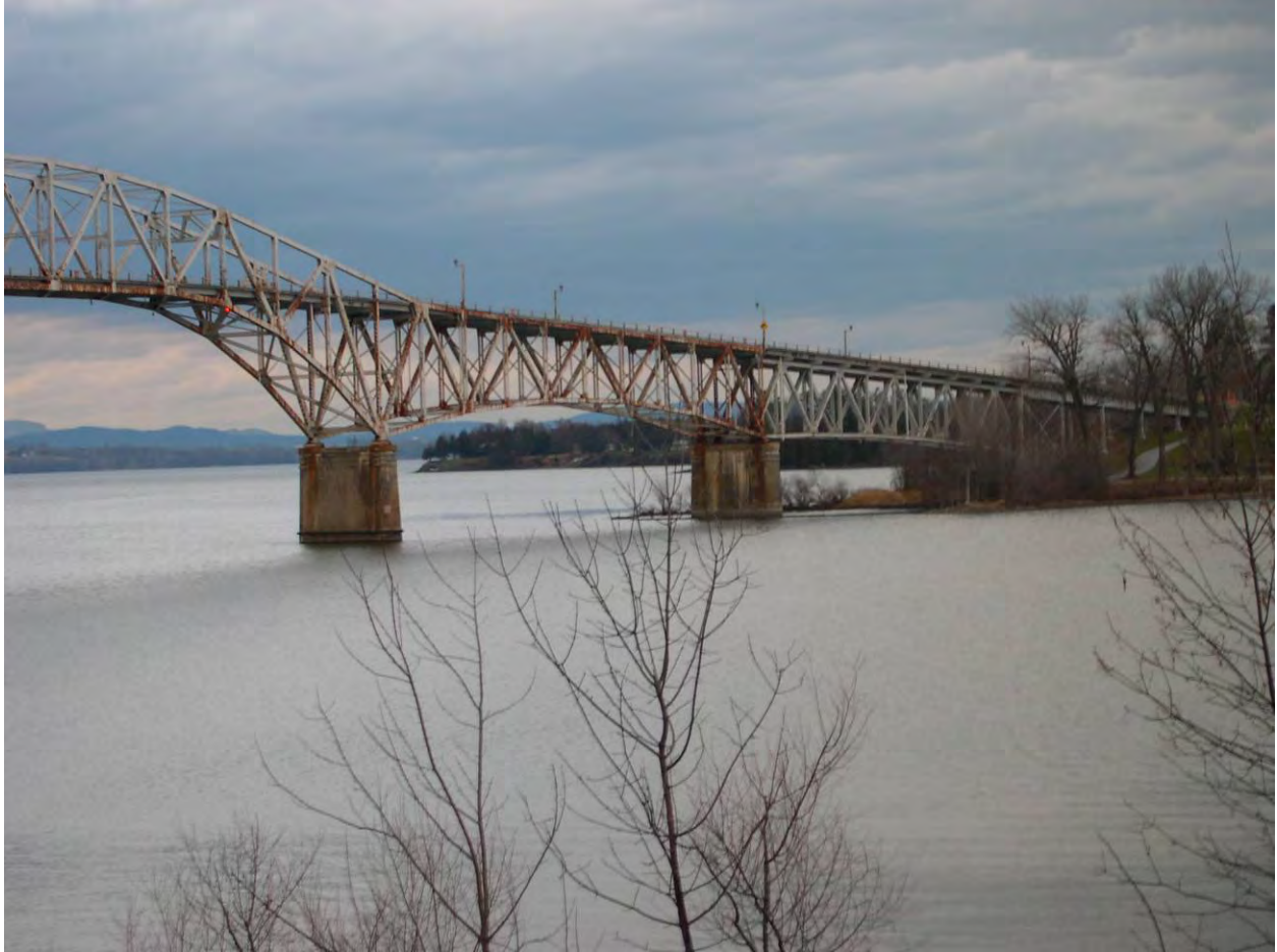
Figure 97. View of Spans 8 and 9, east side.