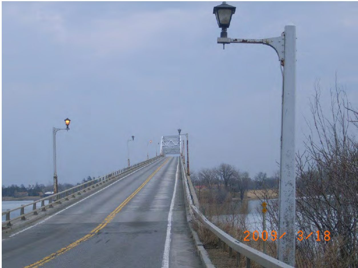
Figure 80. View of the bridge from the New York approach. Photograph by New York State Department of Transportation, March 18, 2009.