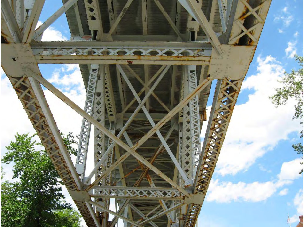
Figure 101. Underside of Span 9, showing cross bracing and laterals. Photograph by New York State Department of Transportation, June 2007.