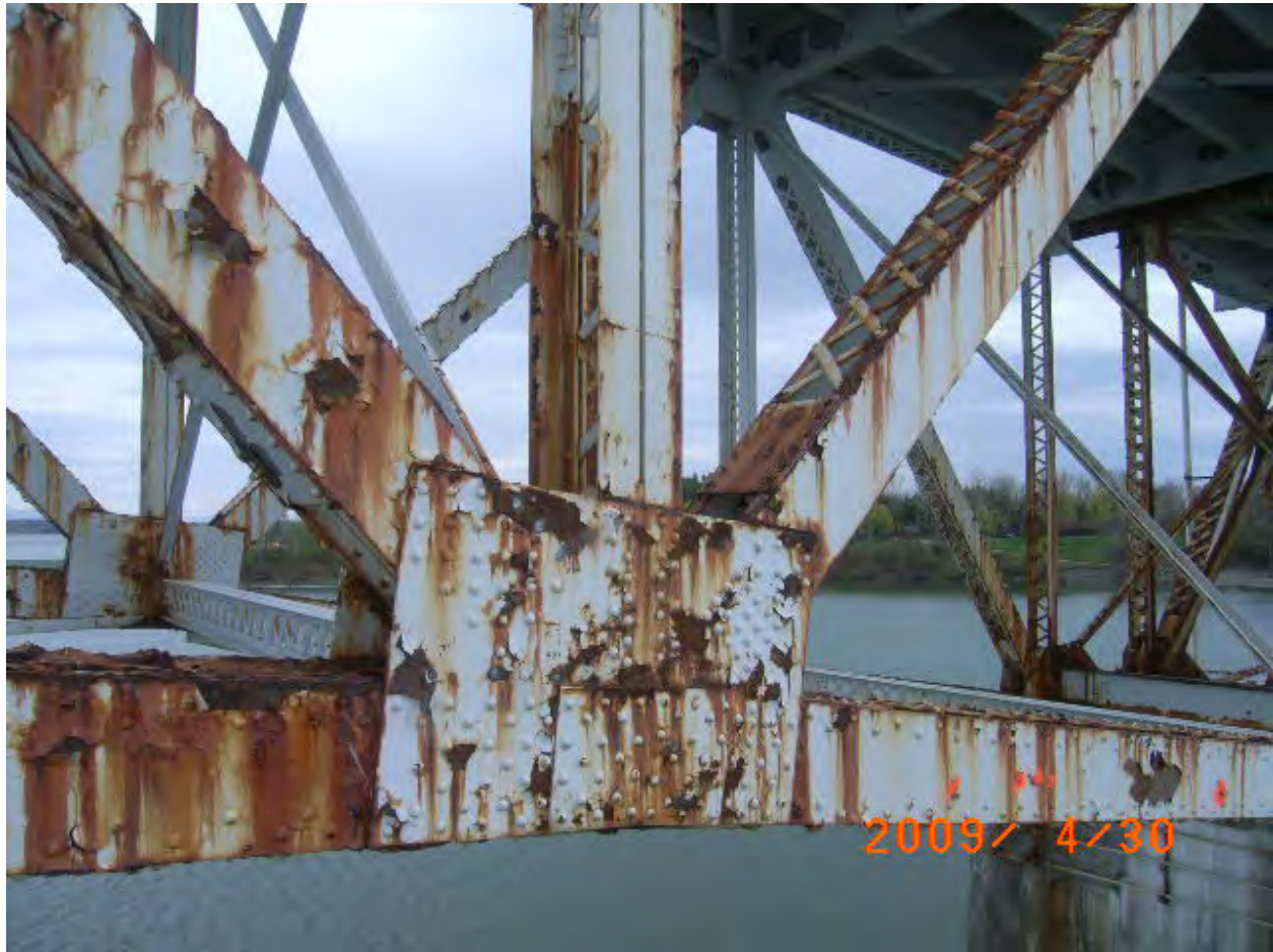
Figure 122. Span 6 lower chord connection at L02.