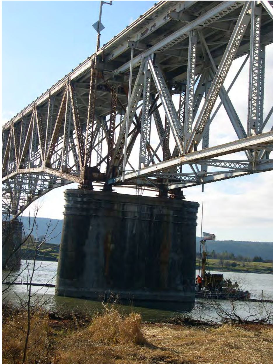
Figure 98. View of Spans 8 and 9 at Pier 8, east side. Photograph by recording team, New York State Museum, November 2009.