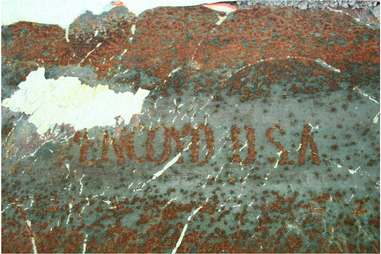
Figure 106. "Pencoyd U.S.A" stamp on salvaged chord or diagonal, located at the Visitor's Information Center. Photograph by recording team, New York State Museum, June 2010.