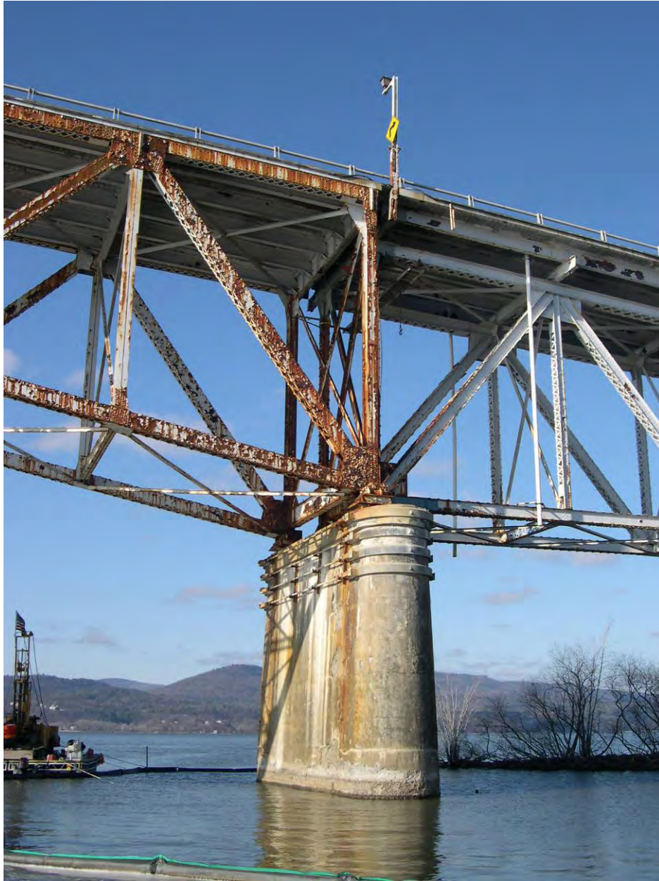
Figure 99. View of Spans 8 and 9 at Pier 8, east side. Photograph by recording team, New York State Museum, November 2009.