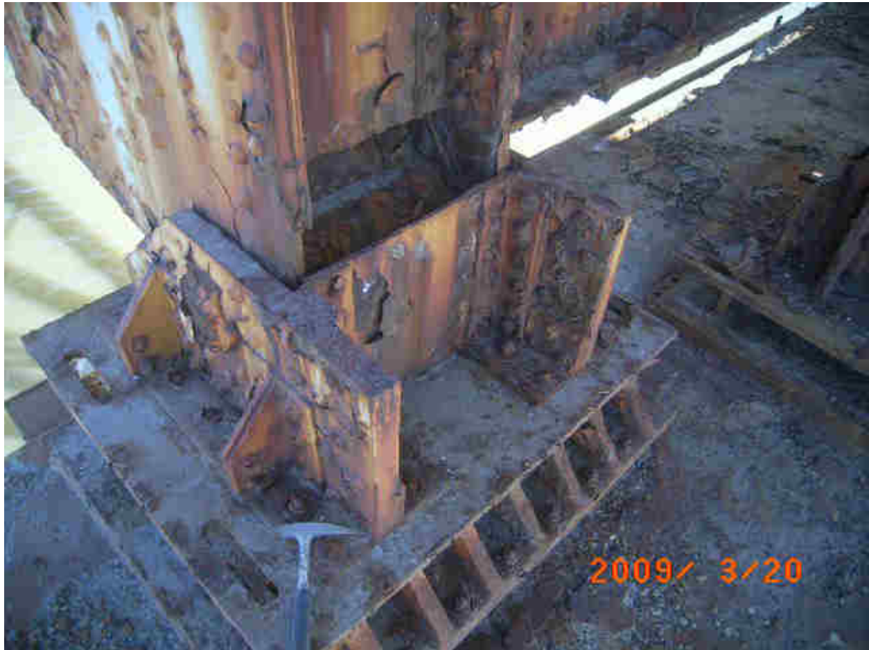
Figure 127. Span 6 at Pier 5, left truss roller bearing.