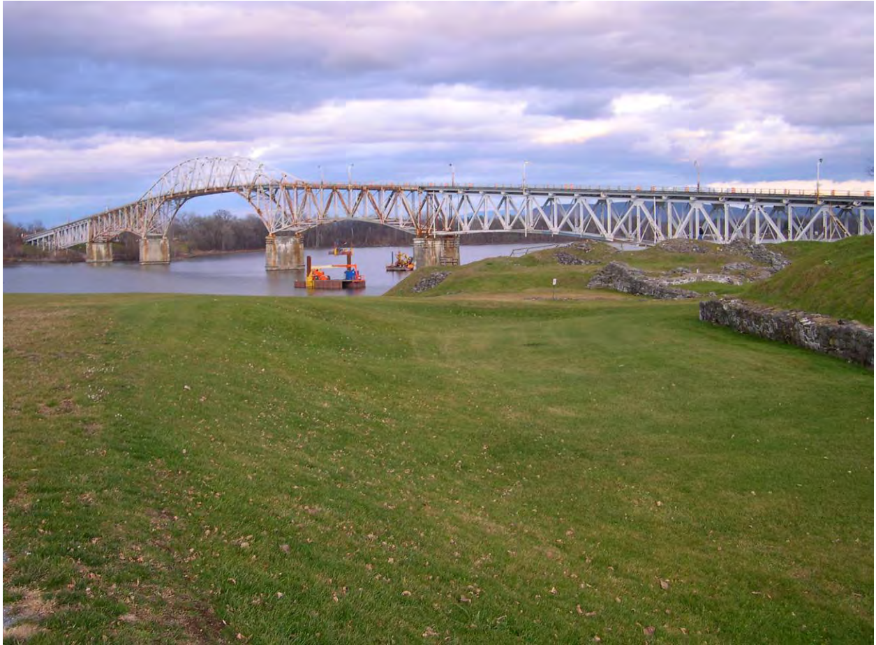
Figure 85. View of the bridge looking east from Fort St. Frederic. Photograph by recording team, New York State Museum, November 2009.