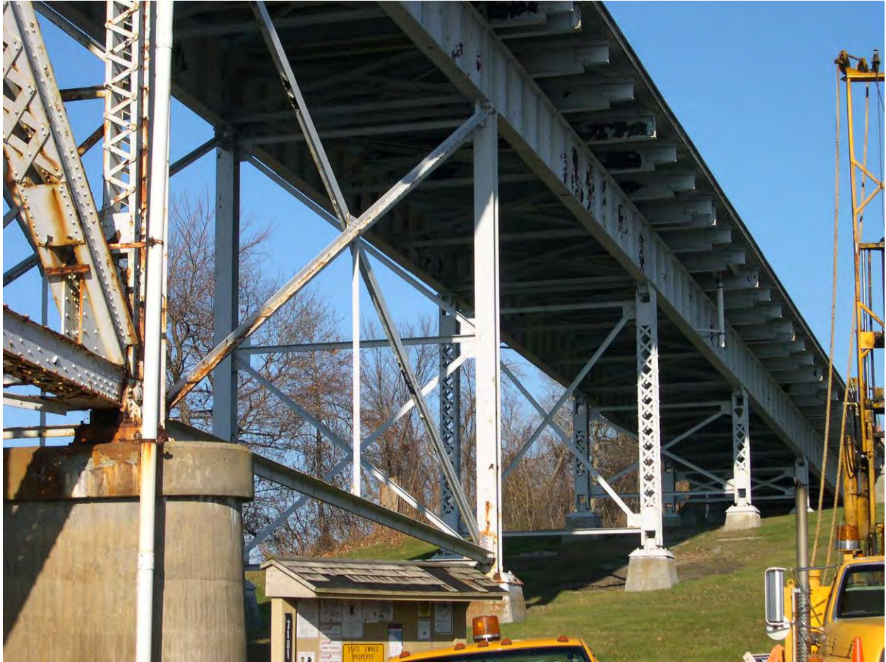
Figure 102. View of Vermont viaduct Spans 10-14. Photograph by recording team, New York State Museum, November 2009.