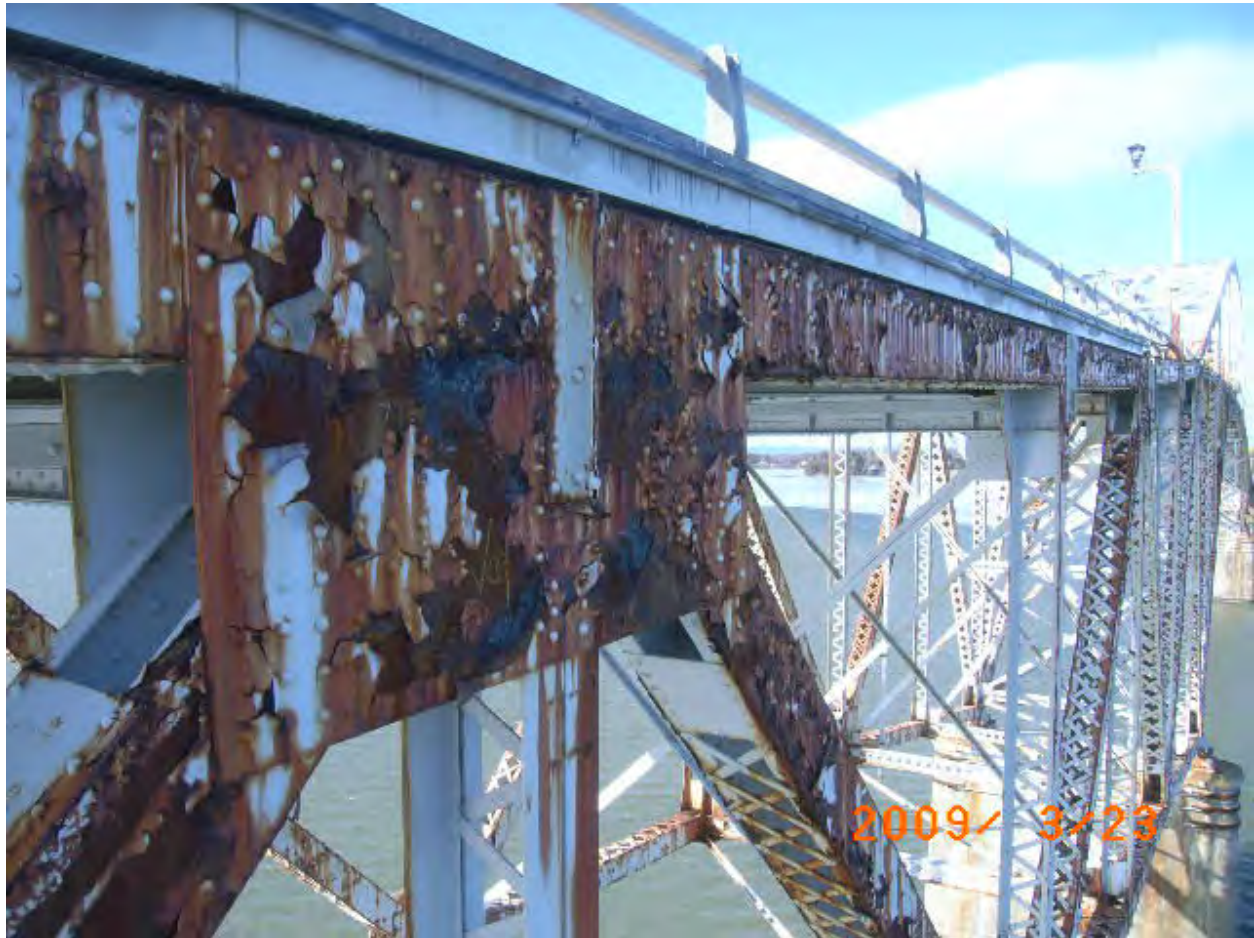
Figure 119. Span 6 upper chord connection at U05.