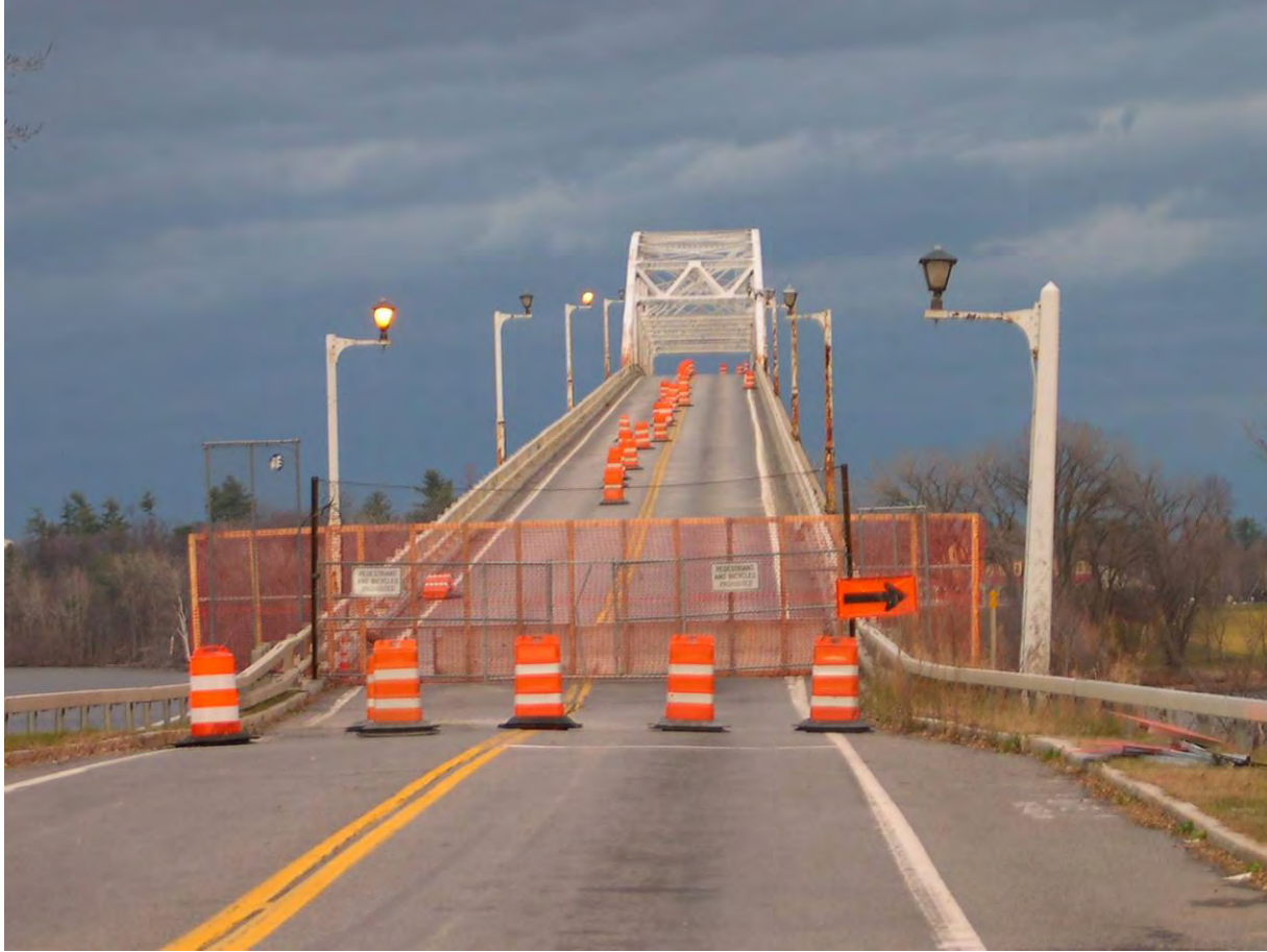
Figure 81. View of the closed bridge from the New York approach. Photograph by recording team, New York State Museum, November 2009.