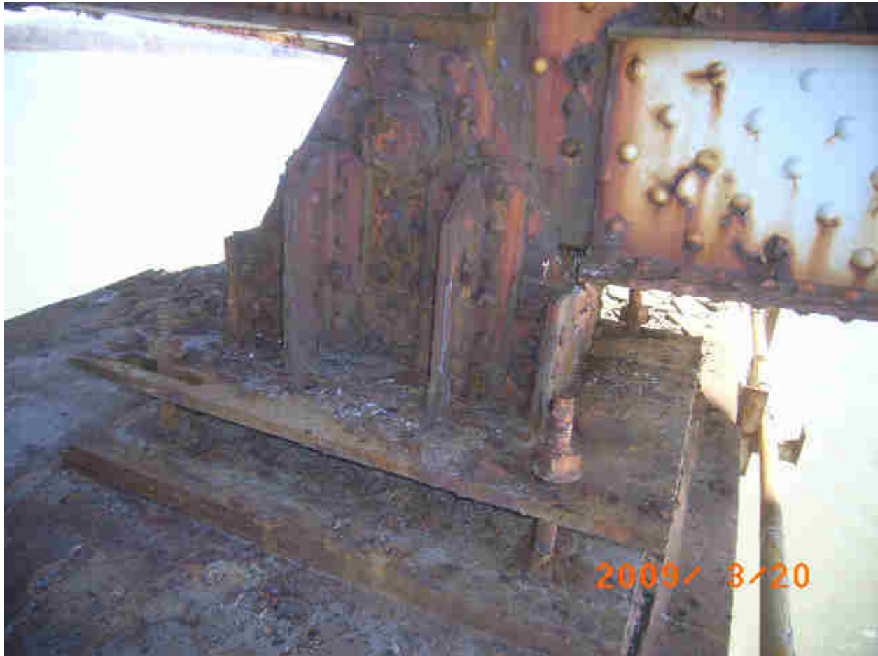
Figure 126. Span 5 at Pier 5, right truss roller bearing.