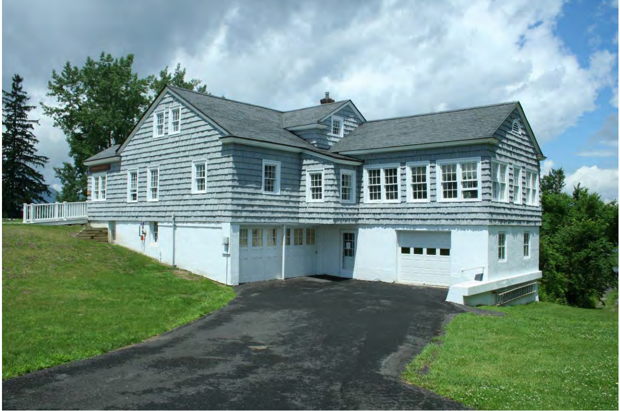
Figure 109. View of the toll house/Visitor's Information Center looking northwest, showing the rear wing added in 1945.