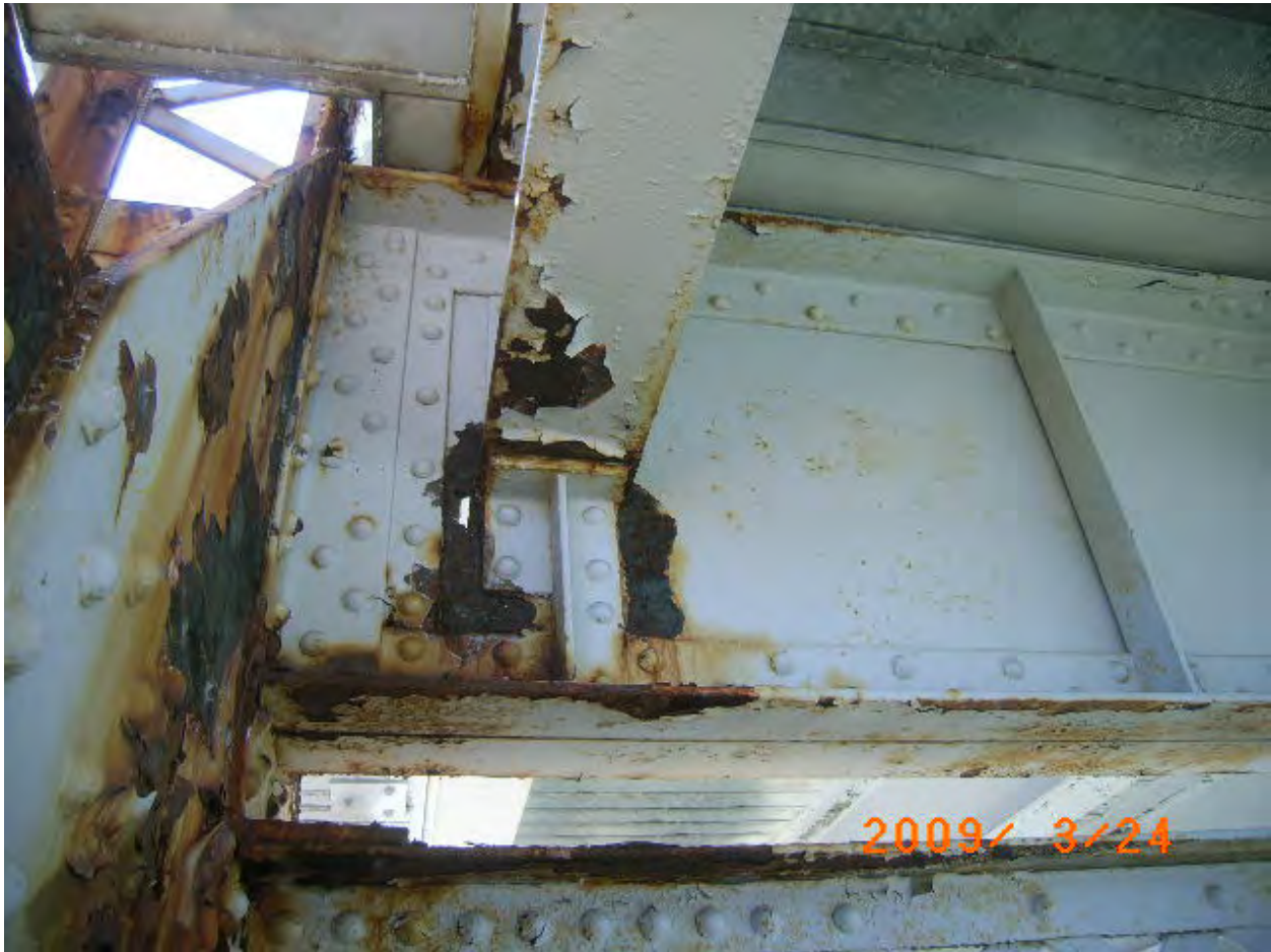
Figure 117. Span 7 Floor Beam 13.