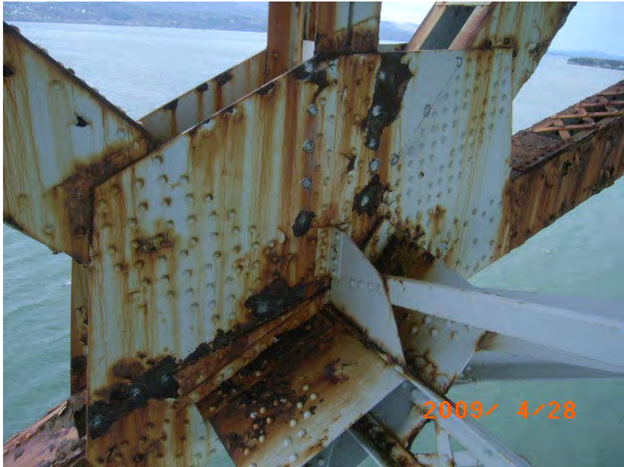
Figure 115. Span 7 lower chord connection at L12, interior side.