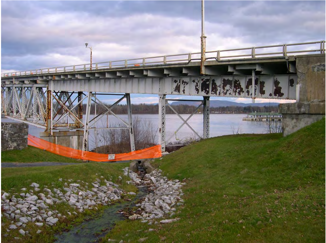
Figure 86. View of New York viaduct Spans 1-3, west side. Shows proximity of Fort St. Frederic southeast bastion (stone wall to left of orange fence). Photograph by recording team, New York State Museum, November 2009.