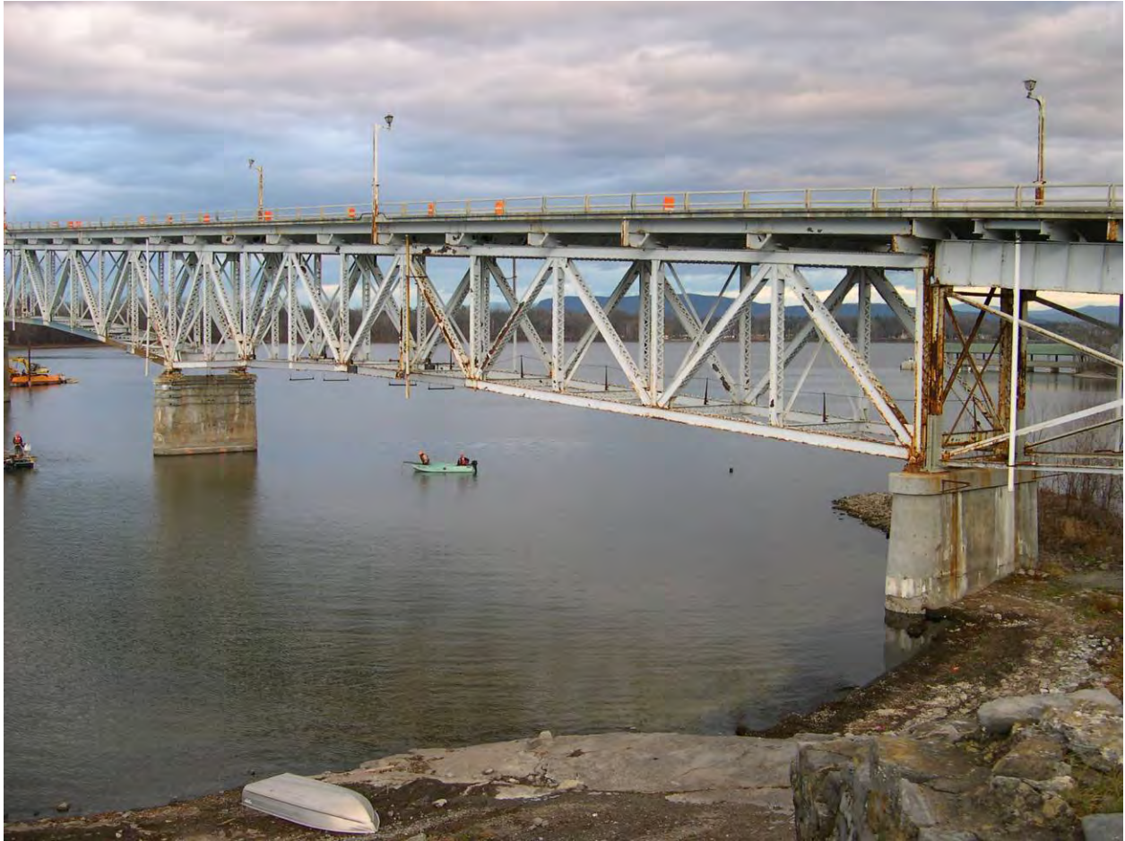
Figure 88. View of Span 4, west side. Photograph by recording team, New York State Museum, November 2009.