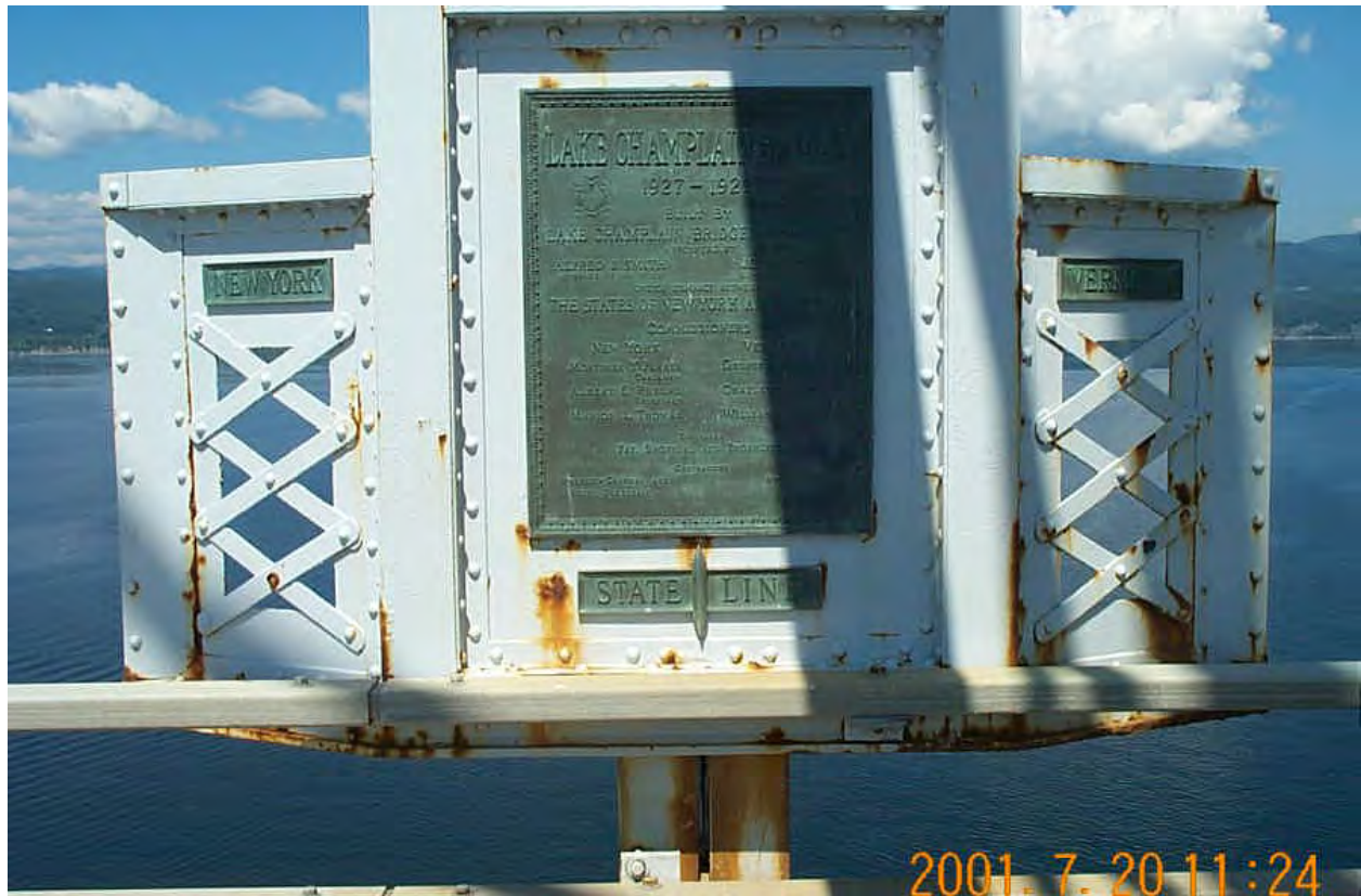
Figure 104. Lake Champlain Bridge builder's plaque at the state line, middle of Span 7, west side. Photograph by New York State Department of Transportation, 20 July 2001.