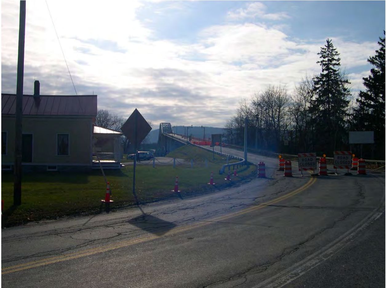
Figure 84. View of the closed bridge from the Vermont approach. Photograph by recording team, New York State Museum, November 2009.