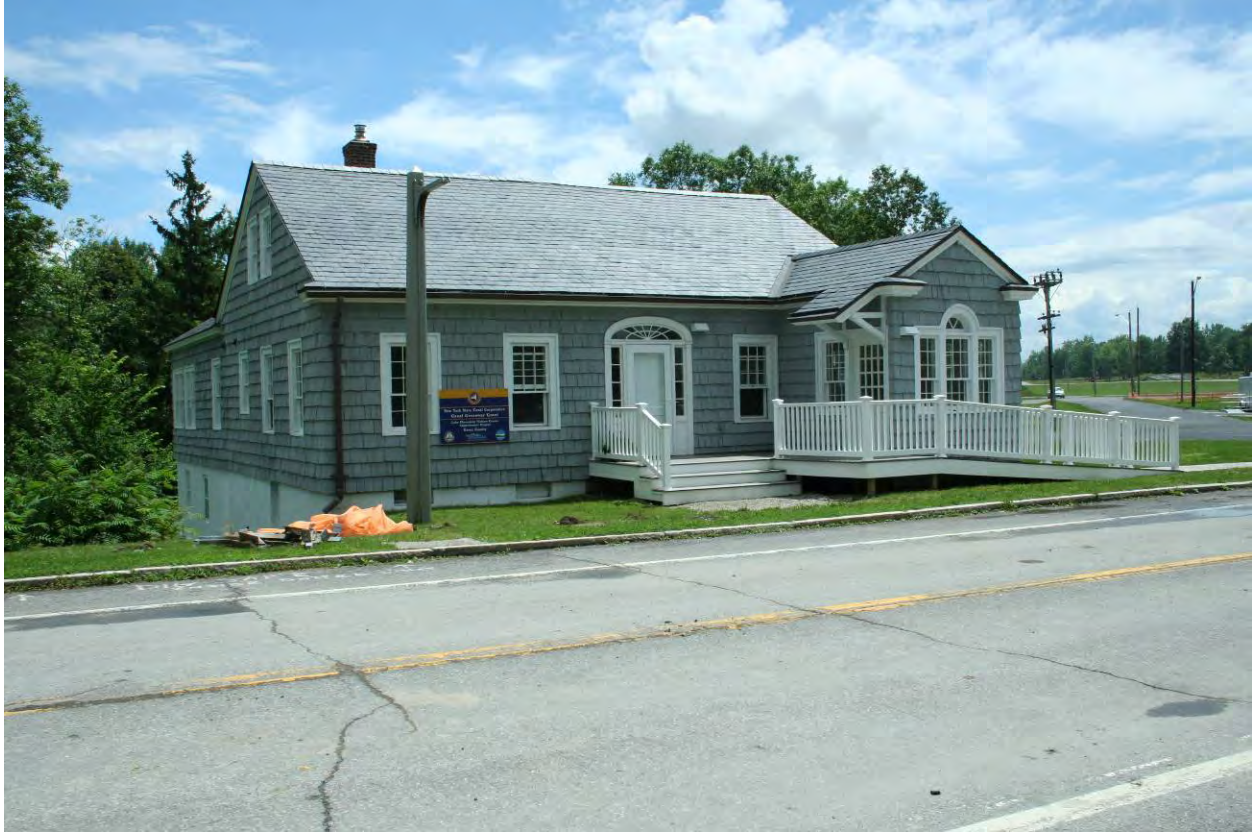
Figure 108. View of the former toll house, presently the Visitor's Information Center for the Regional Office of Sustainable Tourism-Lake Placid Convention and Visitors Bureau, looking southeast. Photograph by recording team, New York State Museum, June 2010.