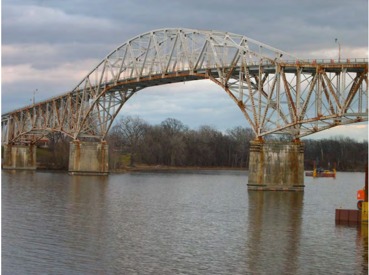
Figure 95. View of Span 7, west side, from Fort St. Frederic. November 2009.