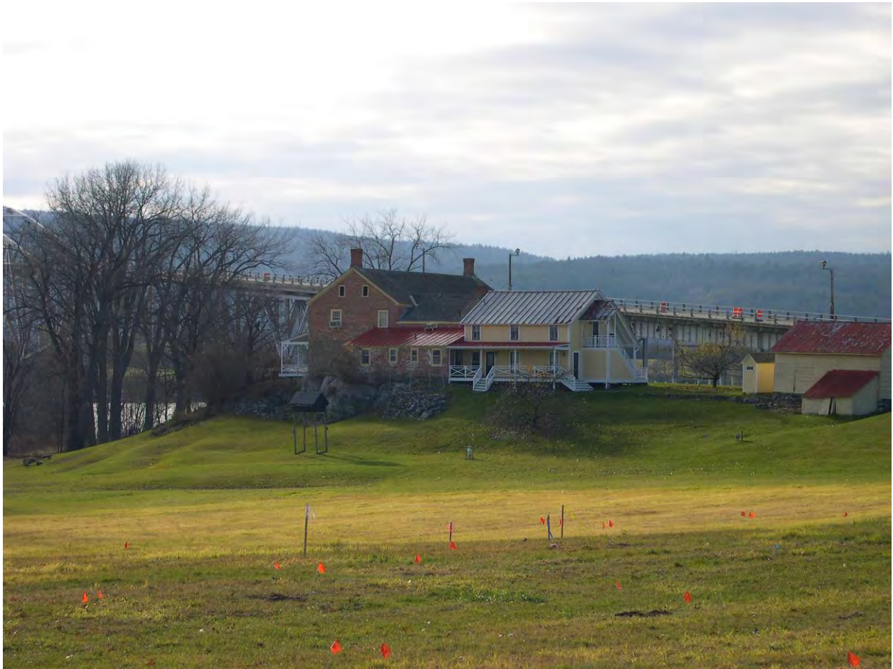
Figure 107. View of the Vermont end of the bridge and the Chimney Point tavern. Photograph by recording team, New York State Museum, November 2009.