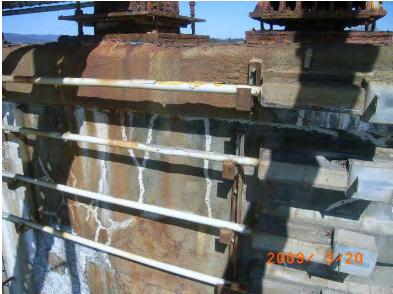
Figure 131. Pier 5 upper south side of stem, cap and tensioners.