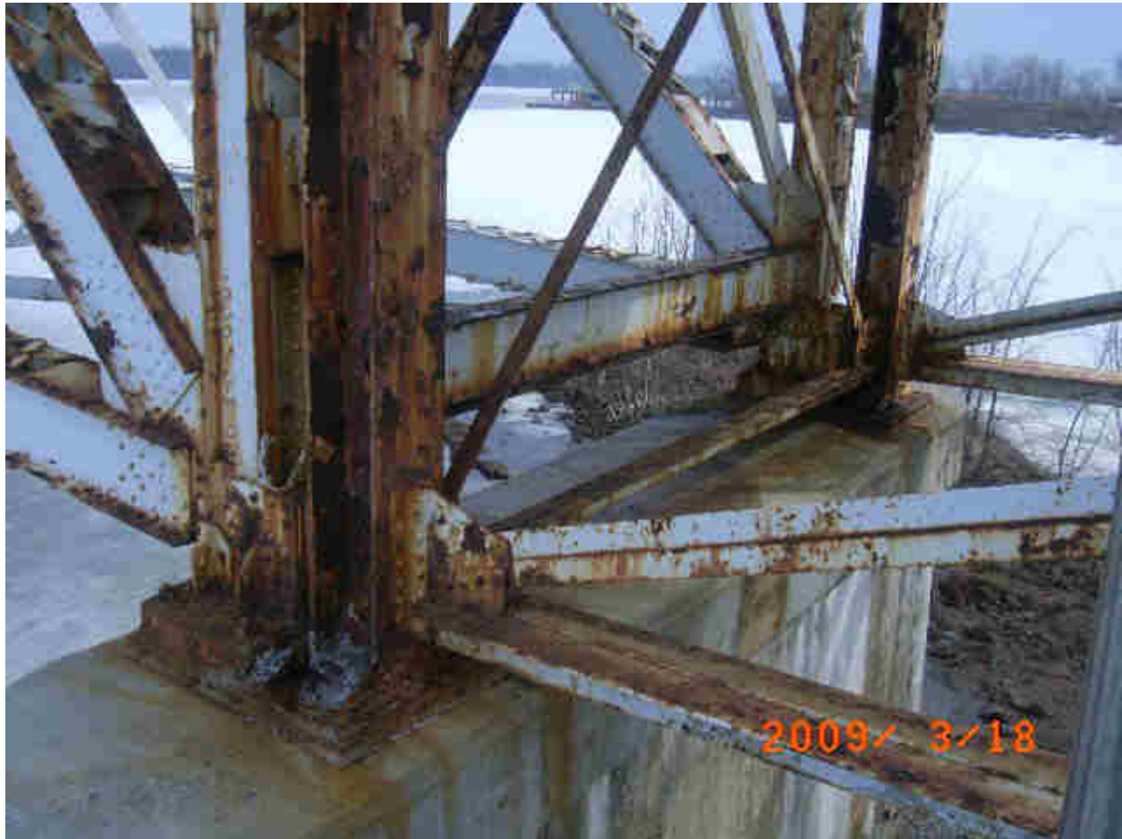
Figure 125. Pier 3 fixed bearings (Spans 3-4).