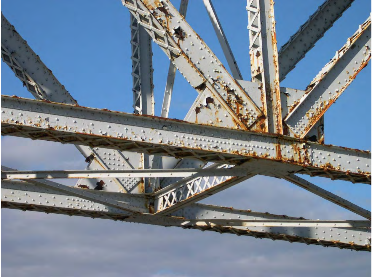
Figure 100. Span 9 east side, lower chord detail. Photograph by recording team, New York State Museum, November 2009.