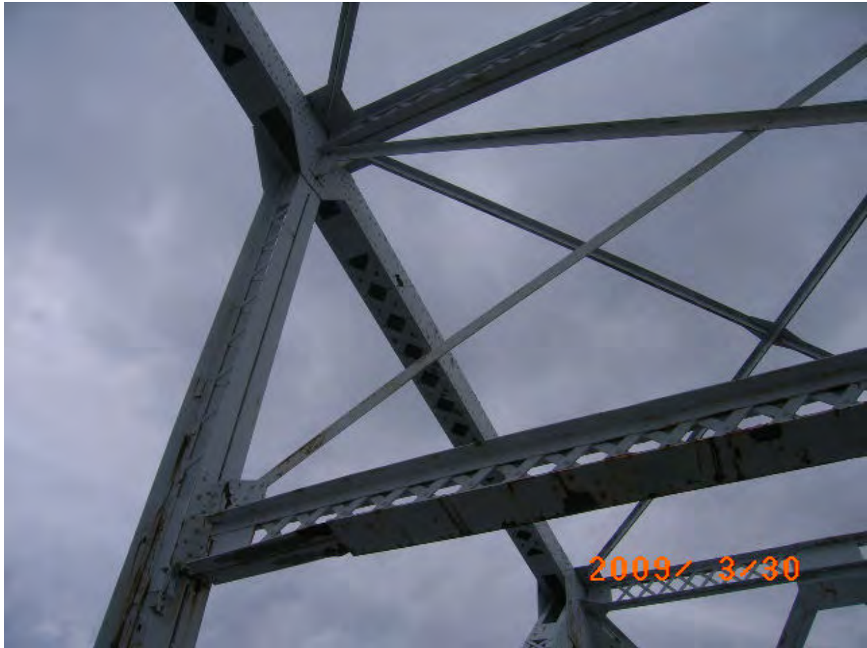
Figure 111. Span 7 strut, upper chord, and sway bracing at Panel Point 16.