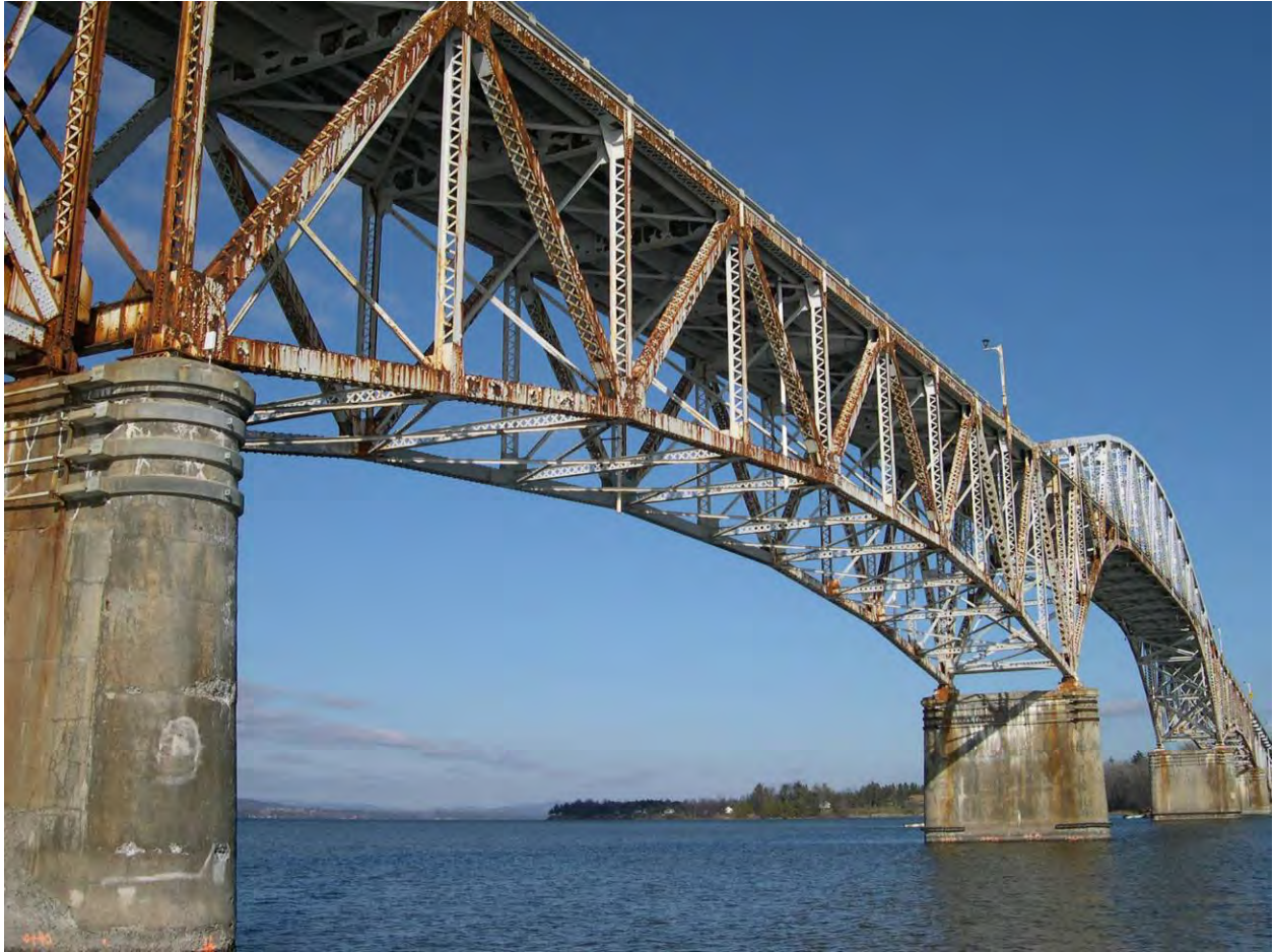
Figure 93. View of Span 6, east side. Photograph by recording team, New York State Museum, November 2009.