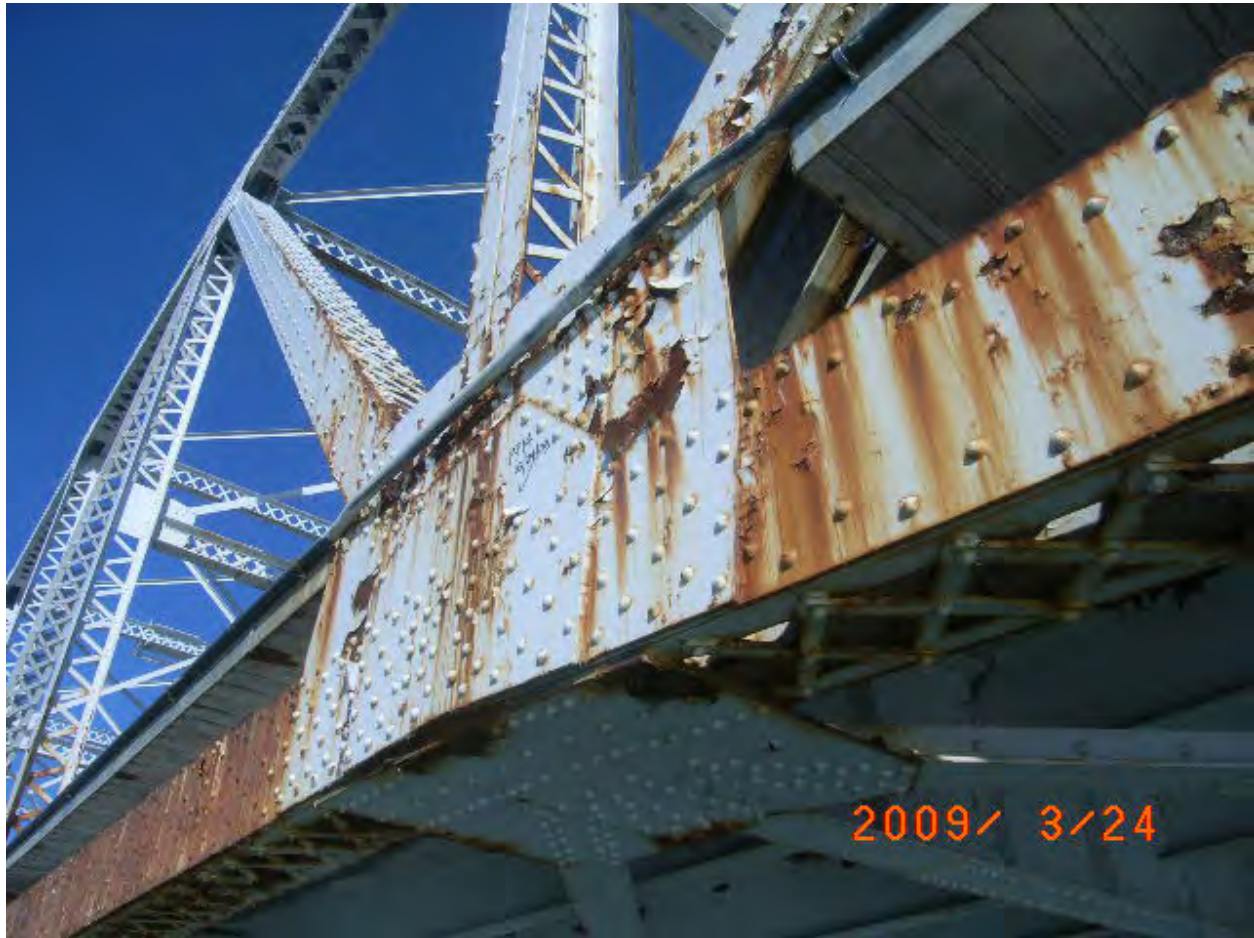
Figure 113. Span 7 lower chord connection at L14.