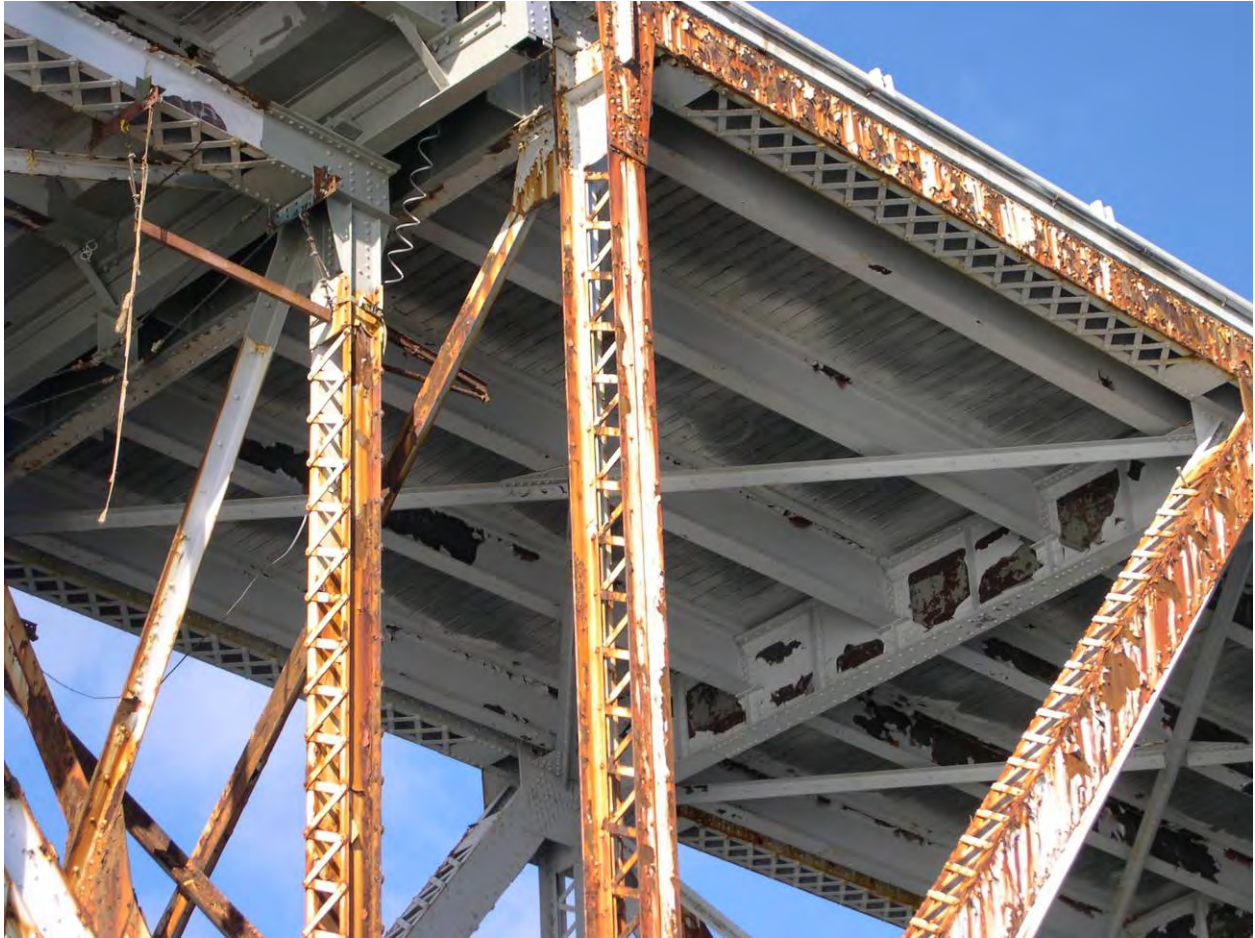
Figure 92. View of Spans 5 and 6 at Pier 5, upper truss detail. Photograph by recording team, New York State Museum, November 2009.