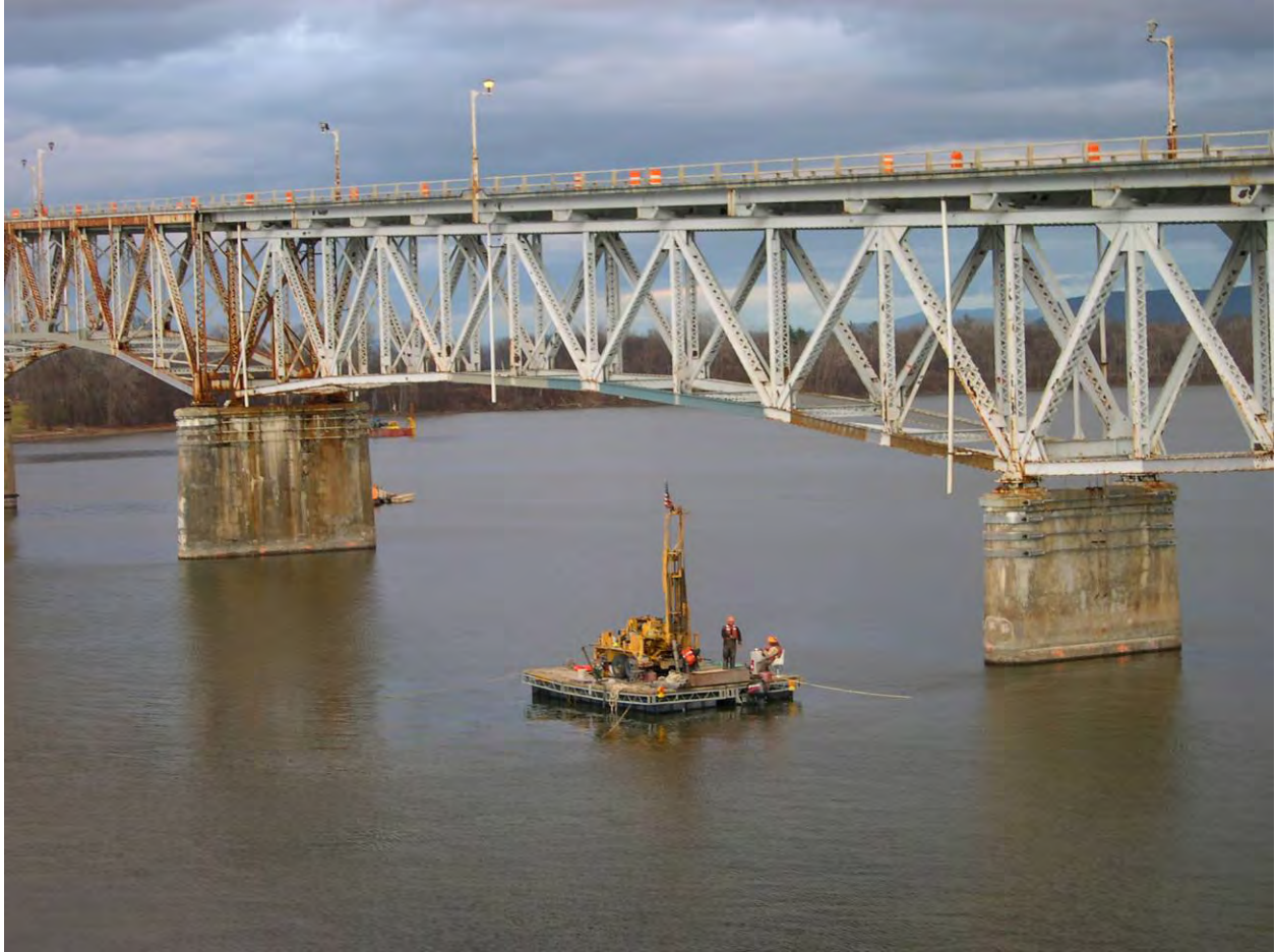
Figure 90. View of Span 5, west side, November 2009. Photograph by recording team, New York State Museum, November 2009.