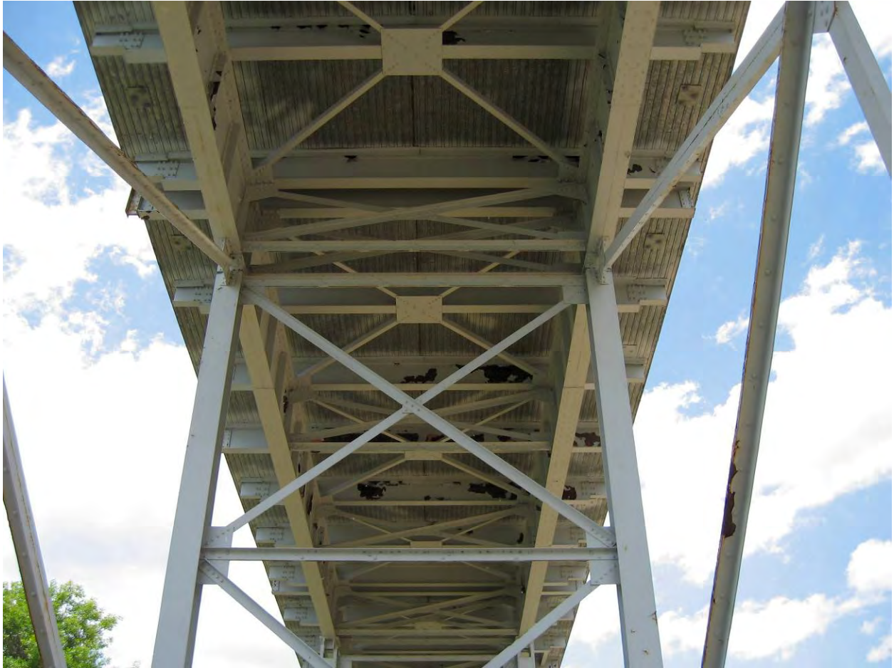
Figure 103. Underside of Span 10, showing cross bracing and laterals. Photograph by New York State Department of Transportation, June 2007.