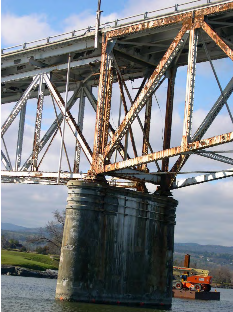
Figure 91. View of Spans 5 and 6 at Pier 5, east side. Photograph by recording team, New York State Museum, November 2009.