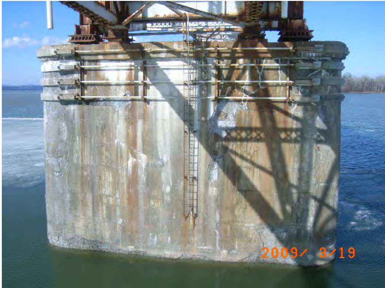
Figure 130. Pier 5, south side of stem. The potential failure of this pier resulted in the permanent closure of the Lake Champlain Bridge.