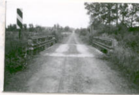
Portal view - Northern approach