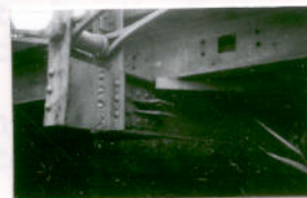
Joint detail of vertical post and diagonals