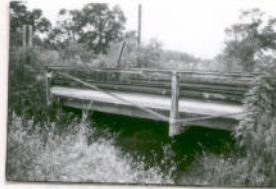
Side perspective view - looking West