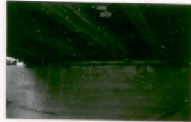
View of Northern abutment and subdeck structure