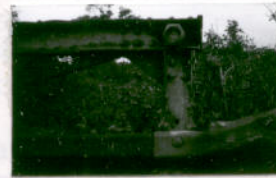
Joint detail of end post and top chord