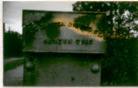
Nameplate on end of top chord