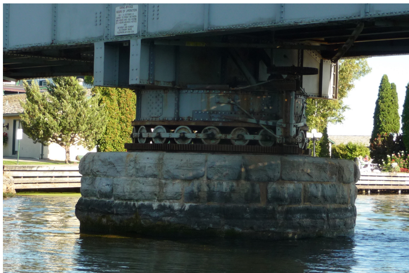
Figure 3: Detail of the central support and operating mechanism of the Gananoque Swing Bridge, viewed from the northwest (photo E. Tumak, Sept. 2013).

support for the bridge deck and enclose a single-lane road bed. The bridge rotates horizontally on a circular pivot point, or vertical locating pin, located at its centre of gravity.