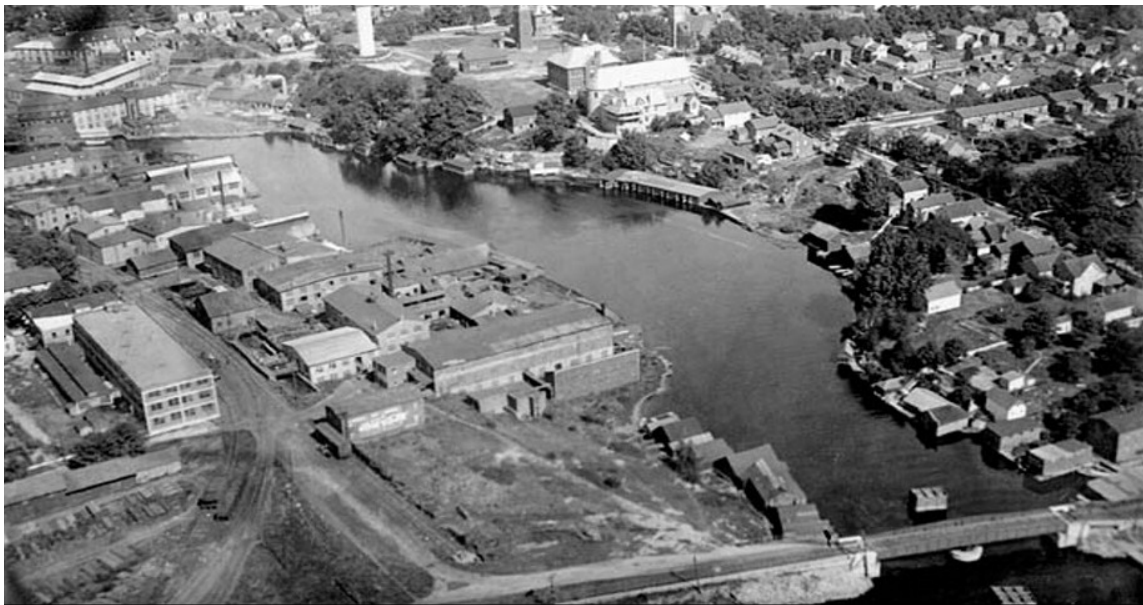
Figure 10: 1920 aerial view showing the Swing Bridge in the bottom right.