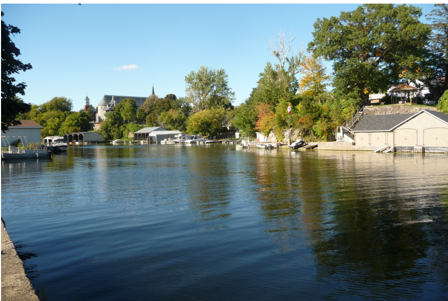
Figure 12: Left – East shore of the Gananoque River viewed from the north side of the Swing Bridge (photo, E. Tumak, Sept. 2013).

As archival images also indicate, land use since 1900 in the vicinity of the Swing Bridge appears dominated by marine-related structures hugging the shoreline of the Gananoque River, with open land on either side of Mill Street at Water Street with industrial structures from the late-19 th and early-20 th centuries further north, while on the east, residential and visitor accommodation dominates the approach to the bridge.