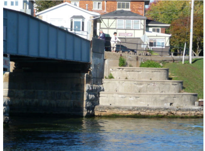
Figure 5: East abutment and stepped protective embankment of the Gananoque Swing Bridge, viewed from the northwest (photo E. Tumak, Sept. 2013)

The rotors below the road bed connecting the deck with the central pier, enable the bridge to rotate 90 degrees, thereby allowing tall water vessels to pass on either side. In the closed position the bridge provides a vertical clearance of approximately 2.5m during the 100 year storm event, which is sufficient for smaller craft. During drier periods the vertical clearance is approximately 4m. This type of swing bridge does not require counterweights in comparison with other moveable bridges. However, when open, the bridge must maintain its own weight as a balanced double cantilever, and aiding in this are vertical stiffening plates (somewhat