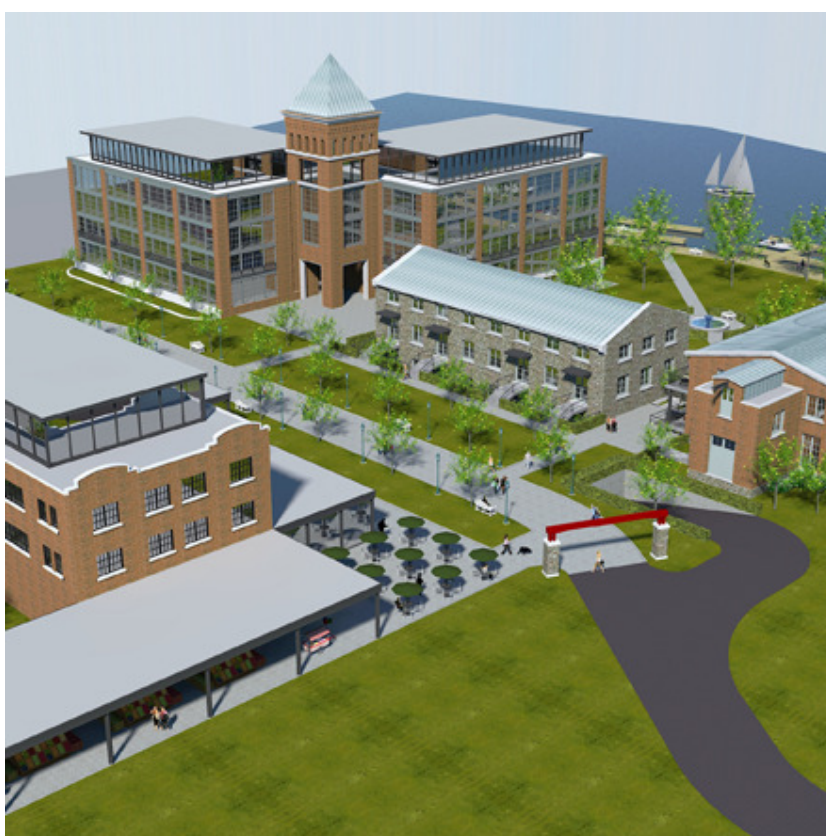
Figure 15: proposed development along Mill Street, promoted as 15 Clarence Street / Textron Property, giving a rendering view to the northeast towards the Cliff Craft complex (Millier Dickinson Blais architects, 2013).

Bridges are very prominent structures because of their prominence in transportation networks. They funnel or restrict traffic both land based or water borne and, because of their expense, are relatively rare. Bridges with distinctive features, such as a swing bridge are even more notable and rare. Therefore, while Gananoque is blessed by a variety of bridges and crossings over the Gananoque River, by its very nature, the Gananoque Swing Bridge is prominent. Its, high state of repair, age, and original integrity make it a rare example in Canada.