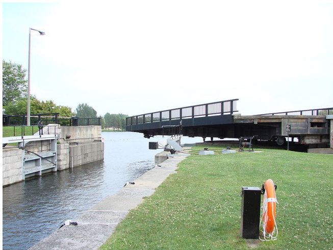
Figures 8-9: Above – Hogs Back Swing Bridge, Rideau Canal System, Ottawa, showing the asymmetrical structure swinging from one end only, and partially open. Left – Little Current Swing Bridge, Northeastern Manitoulin and the Island, Ontario.

The opening and closing of the bridge is facilitated by two guide wheels at both underside ends of the bridge deck. A precise horizontal alignment is critical and even at the time of completion required an adjustment where the tracks on the abutments had to be lowered three inches. More recent repairs have continued to contend with differential settling, including major work in 2012-13 which also involved complete mechanical repairs to the centre pier mechanism, and excavation and shoring of the west bridge abutment which was showing signs of settling due to traffic and age. 5