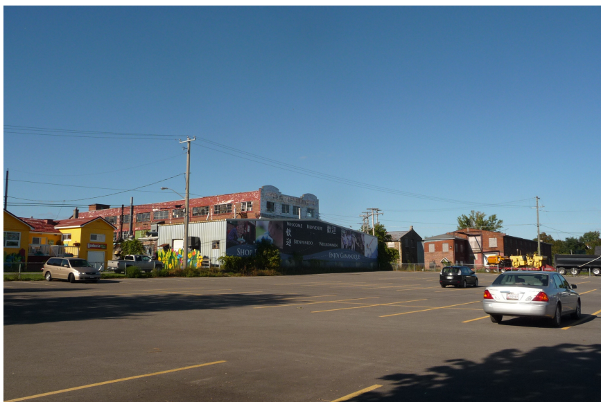
Figure 13: Below – Looking northeast from the intersection of Main and Water streets, showing the former Cliff Craft Building in the distance on the right (photo, E. Tumak, Sept. 2013).

A current large-scale development proposal at the Mill and Water street juncture (Millier Dickinson Blais,