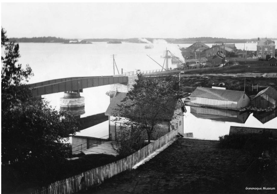
Figure 11: Swing Bridge viewed from the northeast, ca. 1900.

The Gananoque Swing Bridge connects Water Street on the west to the intersection of John and Stone Street