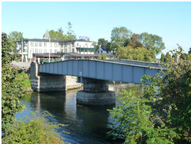
Figure 1: Gananoque Swing Bridge, viewed from the northwest, with the Gananoque Inn in the background.