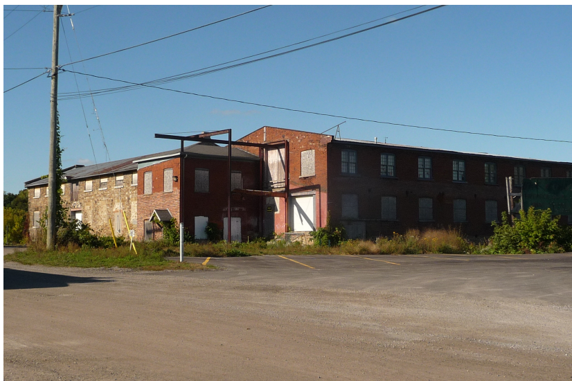
Figure 14: Looking northeast from the intersection of Mill and Water streets, showing the former Cliff Craft Building (photo, E. Tumak, Sept. 2013).