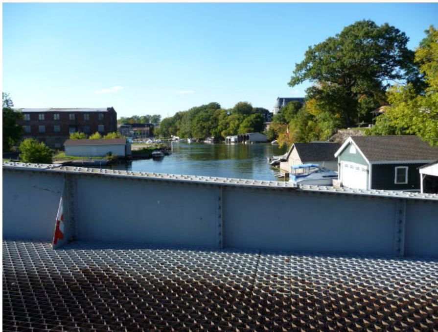
Figure 6: View from the bridge looking north up the Gananoque River showing the bridge deck steel grill of the vehicle lane and one of the stiffening plates.

resembling small buttresses) in the side walls.