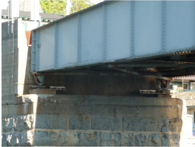
Figure 4: Detail of the east abutment of the Gananoque Swing Bridge, viewed from the northwest (photo E. Tumak, Sept. 2013).