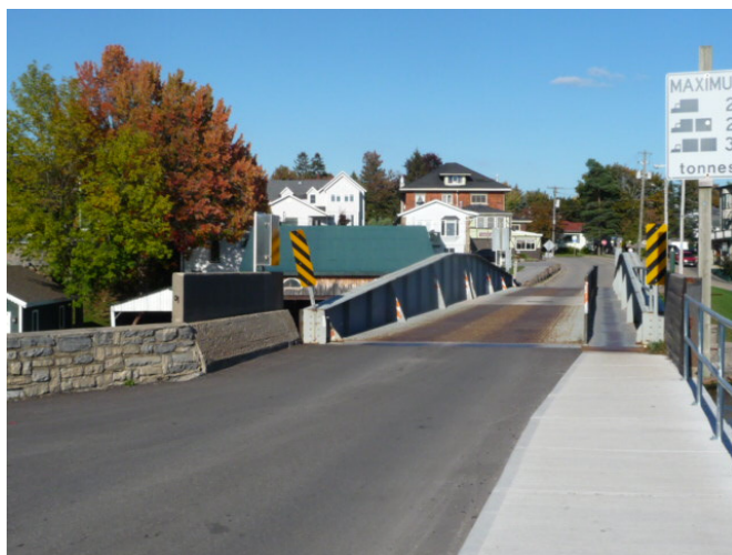
Figure 7: Above – Current bridge deck showing the steel grate deck of the vehicle lane on the left and the pedestrian walk on the right, viewed from the west (photo E. Tumak, Sept. 2013).

The opening and closing of the bridge is facilitated by two guide wheels at both underside ends of the bridge deck. A precise horizontal alignment is critical and even at the time of completion required an adjustment where the tracks on the abutments had to be lowered three inches. More recent repairs have continued to contend with differential settling, including major work in 2012-13 which also involved complete mechanical repairs to the centre pier mechanism, and excavation and shoring of the west bridge abutment which was showing signs of settling due to traffic and age. 5