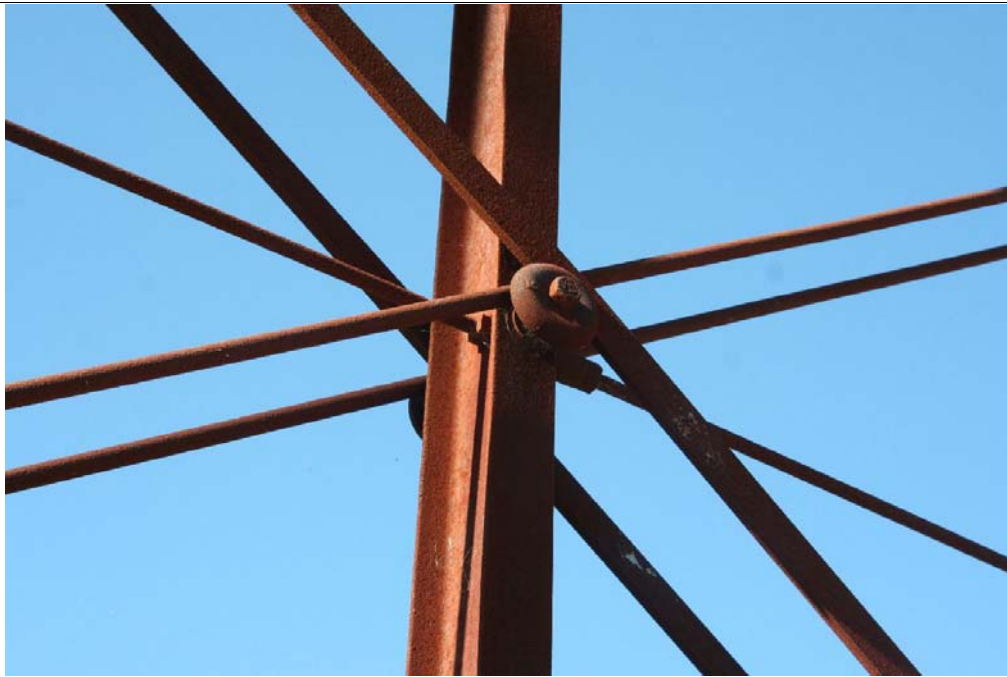
Photo 3: Detail of diagonal members crossing the midpoint of a vertical member and the special Whipple fitting required to accommodate the crossing at the point of double-intersection

Structure ID: 090180AA0333001 Location: 0.10 MI SW OF FM 1991 Facility Carried: CR 3112 Longitude: -97.57200162