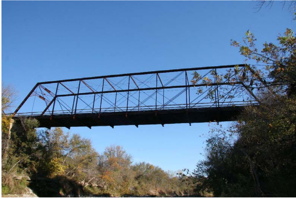
Photo 1: Northwest elevation of Whipple truss, facing southeast, showing the distinctive double-intersection Pratt design that is the character-defining feature of a Whipple truss

Structure ID: 090180AA0333001 Location: 0.10 MI SW OF FM 1991 Facility Carried: CR 3112 Longitude: -97.57200162