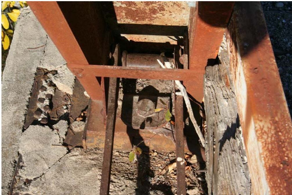
Photo 4: Detail of pin connection of end diagonal with bottom chord, also showing the extant roller-nest expansion bearing