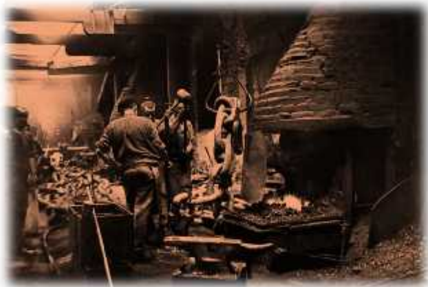
Chainsmiths at work at Newbridge