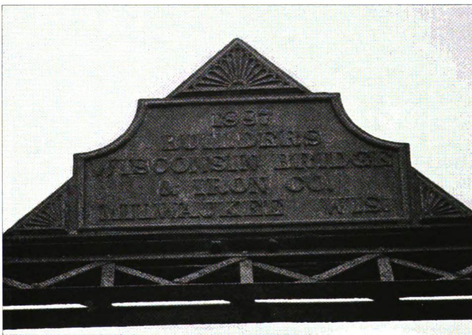
Mill Road Bridge (P-36-022), Town of Manitowoc Rapids, Manitowoc County

Top: South approach - Source: J.A. Hess, 1986