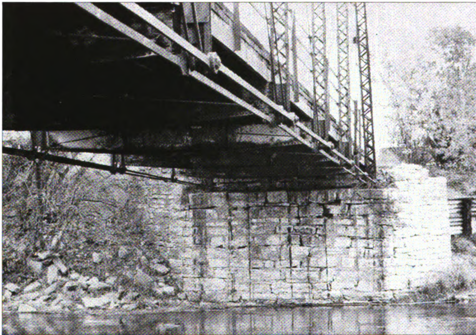
Mill Road Bridge (P-36-022), Town of Manitowoc Rapids, Manitowoc County North abutment