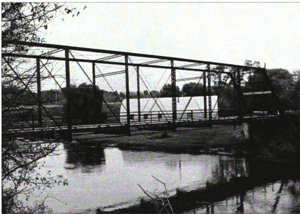
Mill Road Bridge (P-36-022), Town of Manitowoc Rapids, Manitowoc County

Top: Barrel view